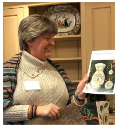
Door prize from Victoria Sampler