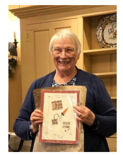
Door prize from With My Needle