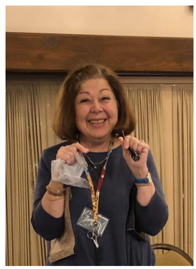
A door prize from a friend of Stitcher's Hideaway