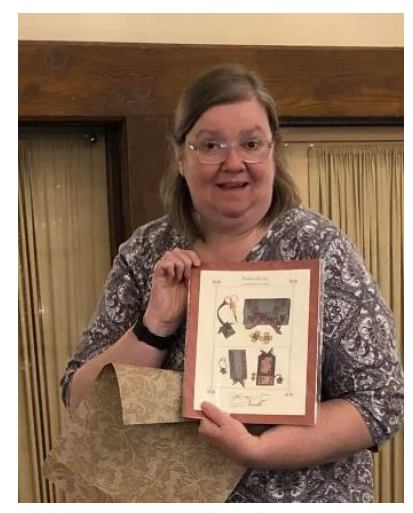
Door prize from With My Needle