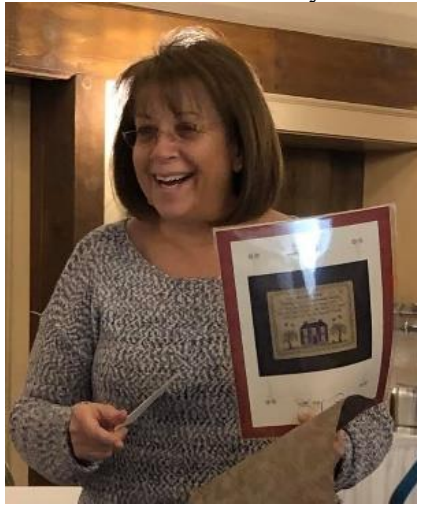
Door prize from With My Needle