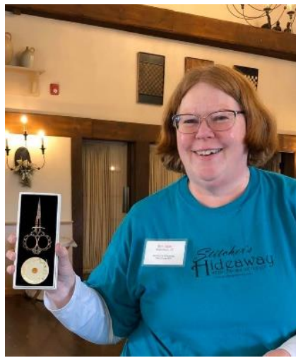
A door prize from a friend of Stitcher's Hideaway