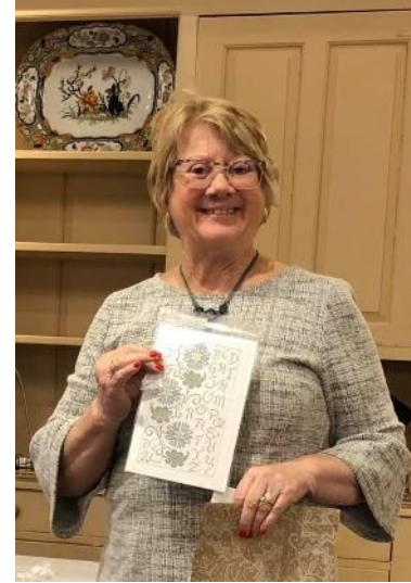
A door prize from 123Stitch