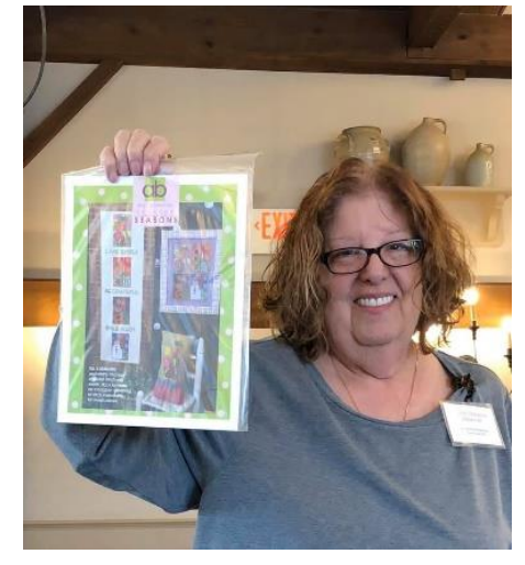
Door prize from <u>Amy Bruecken</u> <u>Designs</u>