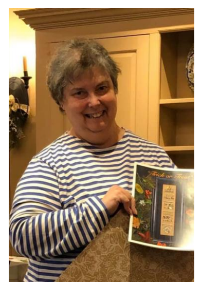
Door prize from Victoria Sampler