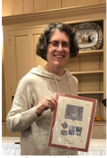
Door prize from With My Needle