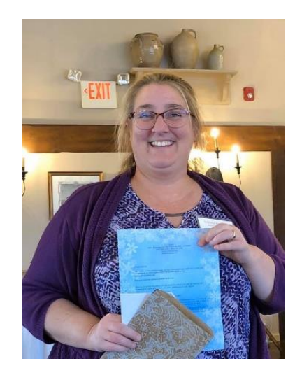
A door prize from <u>123Stitch</u>