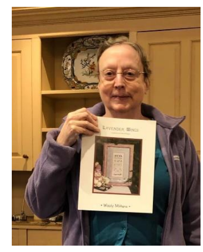
A door prize from <u>123Stitch</u>