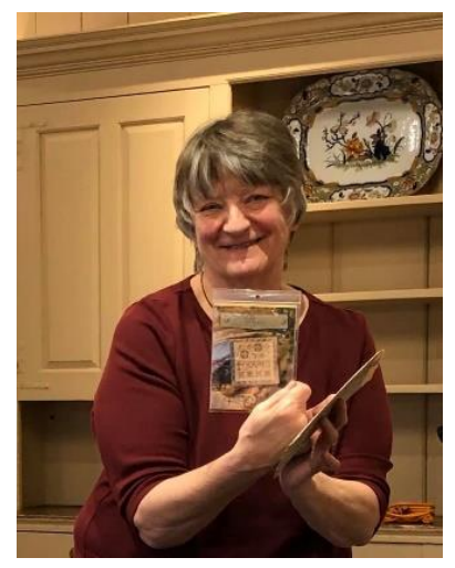
A door prize from 123Stitch