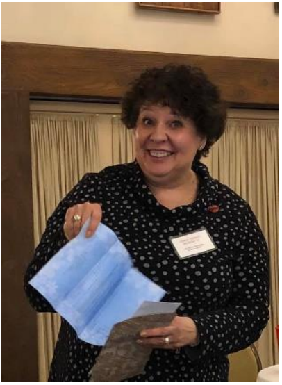
A door prize from <u>123Stitch</u>