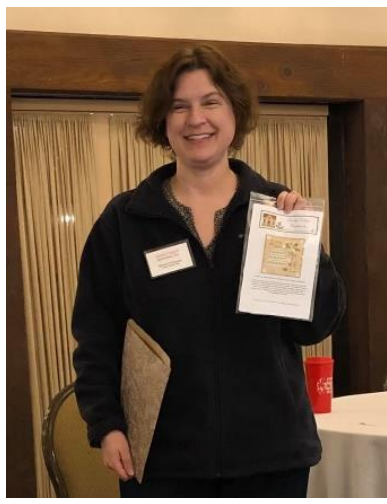
A door prize from <u>123Stitch</u>