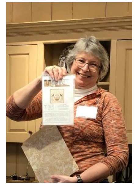
A door prize from <u>123Stitch</u>