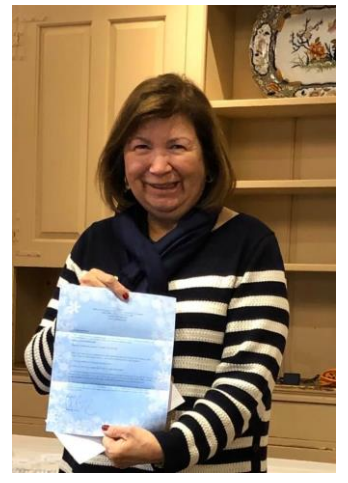
A door prize from <u>123Stitch</u>