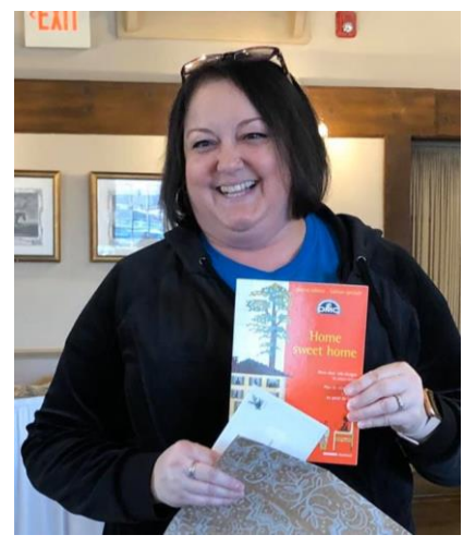
A door prize from <u>123Stitch</u>