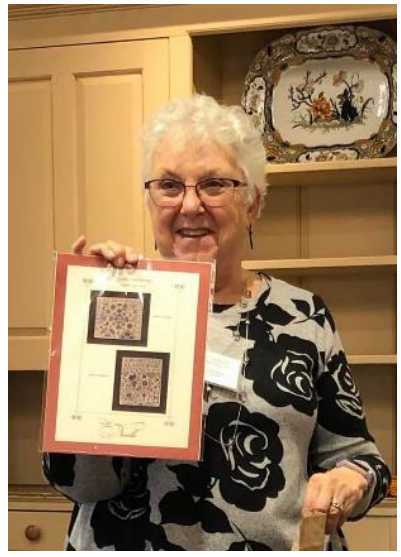
Door prize from With My Needle