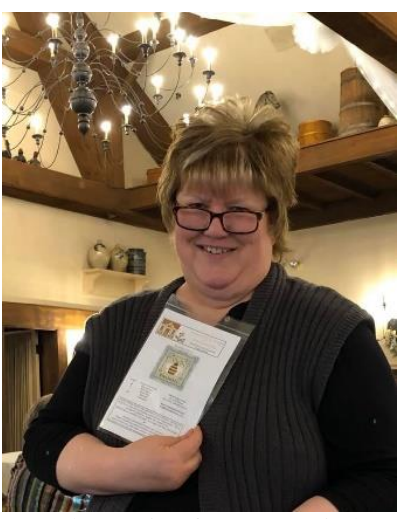
A door prize from <u>123Stitch</u>