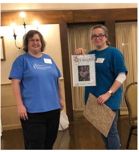
A door prize from <u>123Stitch</u>