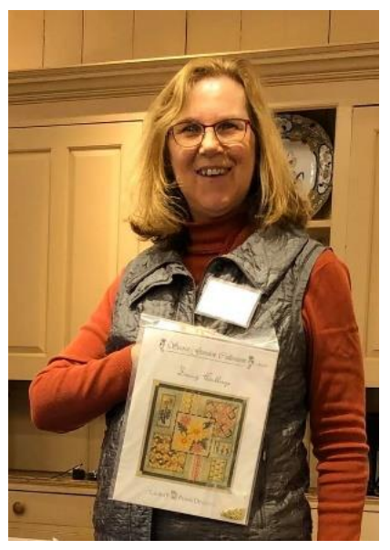
A door prize from <u>123Stitch</u>