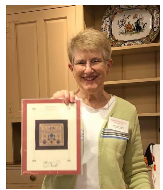
Door prize from With My Needle