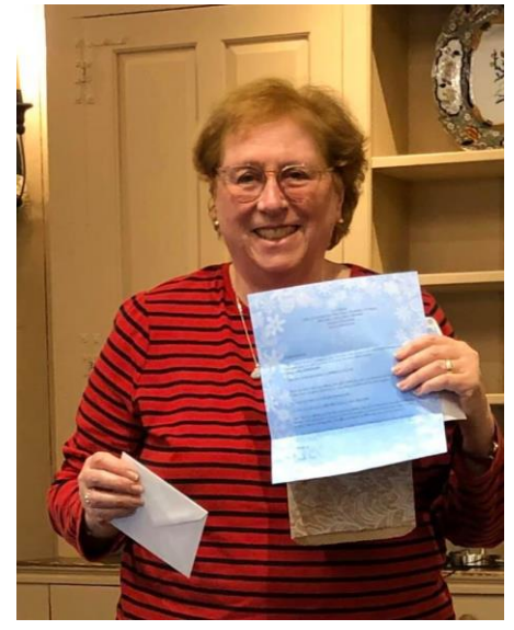
A door prize from <u>123Stitch</u>