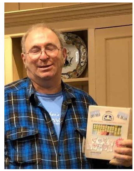
A door prize from <u>123Stitch</u>