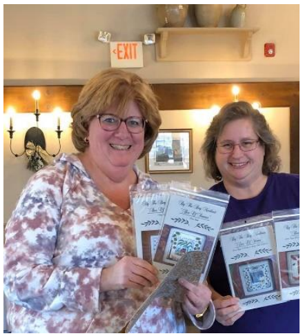
A door prize from The World In Stitches