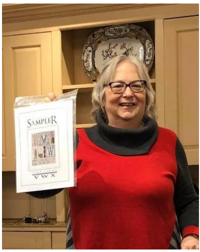
A door prize from 123Stitch