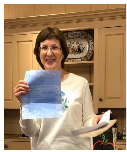
A door prize from <u>123Stitch</u>