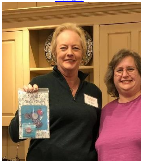
A door prize from <u>123Stitch</u>