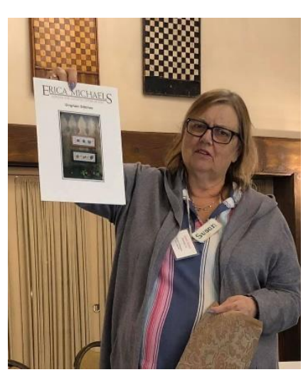
A door prize from 123Stitch