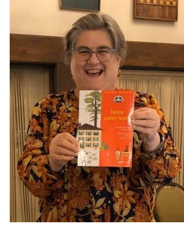
A door prize from <u>123Stitch</u>