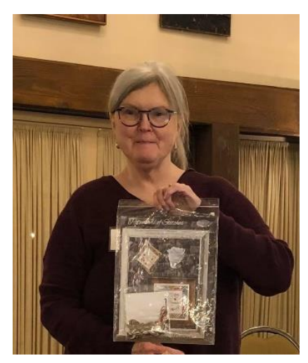
A door prize from a friend of Stitcher's Hideaway