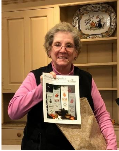
Door prize from Victoria Sampler