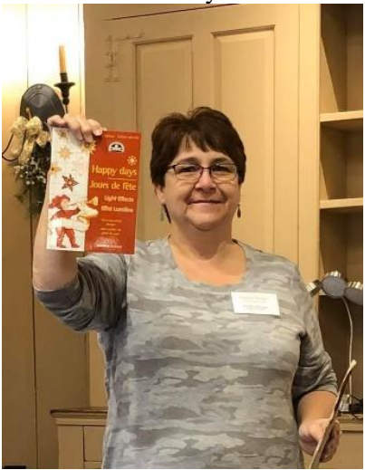
A door prize from <u>123Stitch</u>