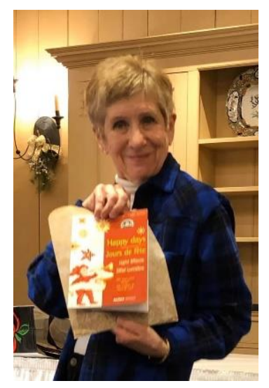
A door prize from <u>123Stitch</u>