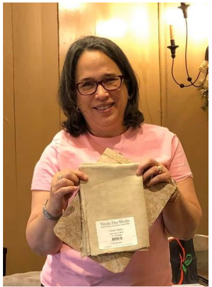
Door Prize from Weeks Dye Works