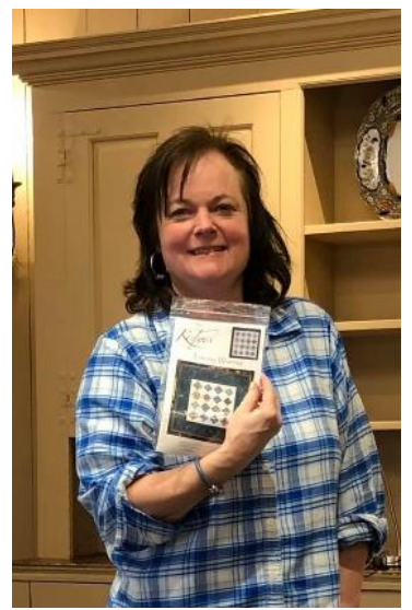
A door prize from 123Stitch