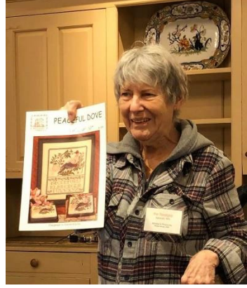
Door prize from Rosewood Manor