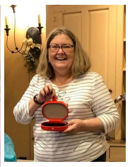
A door prize from a friend of Stitcher's Hideaway