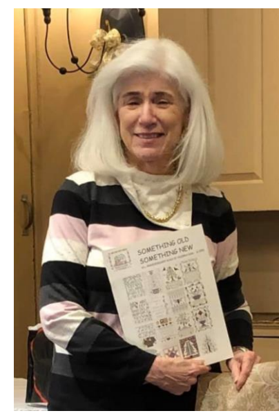
Door prize from Rosewood Manor