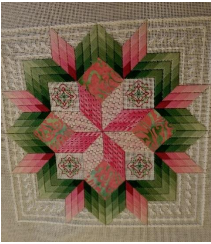
WE ARE AWESOME STITCHERS!!!!!!

Oh, wait! Did I mention that there were DOOR PRIZES?!?