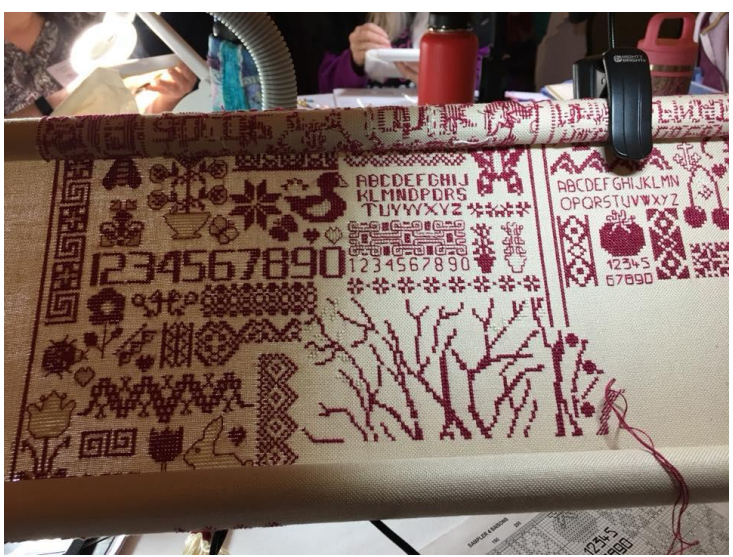
I worked some more on my Red Menace – but still have a ways to go! ~ Sue