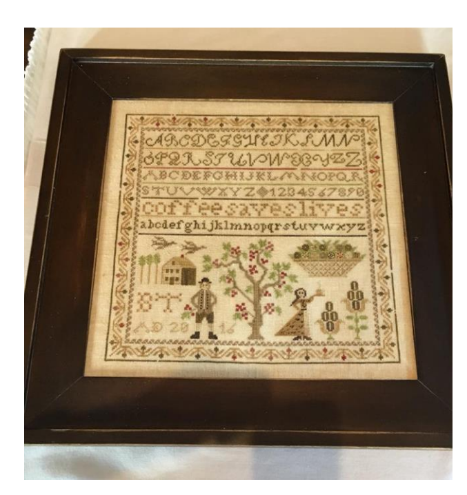
This sampler had us laughing! Among the alphabets are the words "Coffee saves lives"