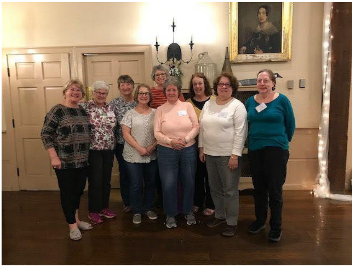
Look at all the Maine-iacs! Their numbers increase each year!

It's been a lot of fun looking at all these pictures and remembering Winter Escape 2018. We can't wait for 2019!!