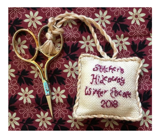
Every attendee received a kit to make this Winter Escape keepsake fob.