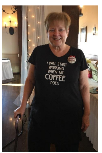
Have cane will travel!

I had a great time being with everyone but was forbidden to cross stitch due to whiplash injuries. I sure missed being able to stitch, but what fun I had going from table to table to spend time catching up with everyone! I had the use of an office chair with wheels that allowed me to glide around the room (what a sight!) and a cane to help me the rest of the time.