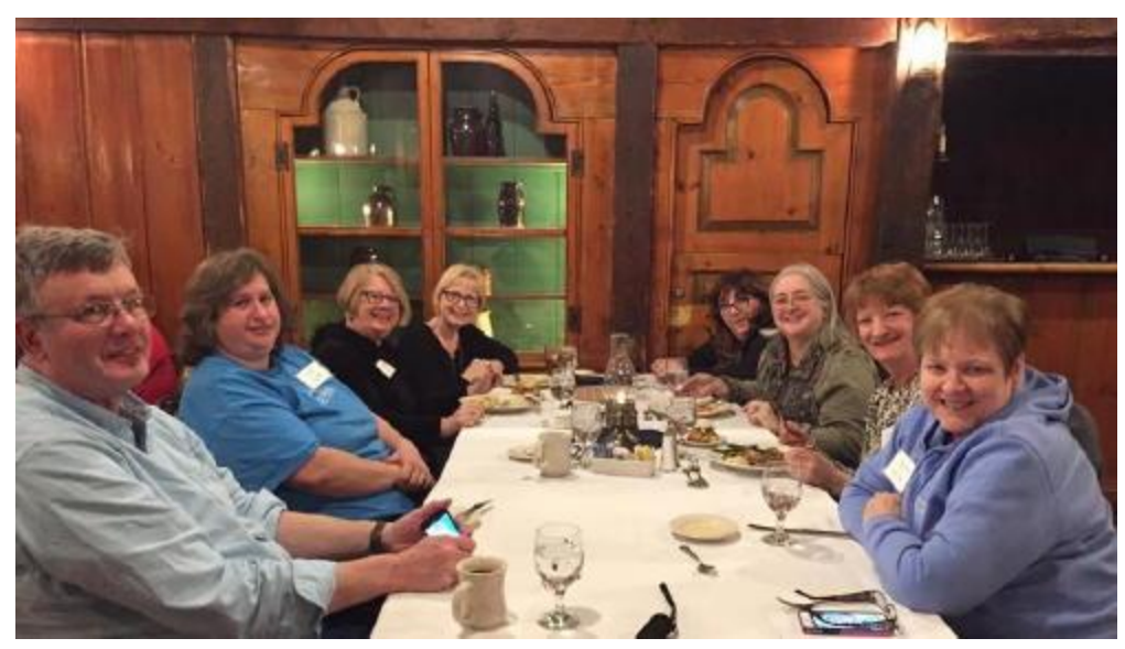
Before and after each meal we enjoyed hanging out and chatting.