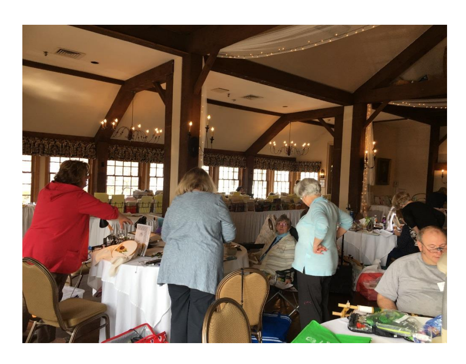
What fun to hear the buzz of all the conversations and laughter!