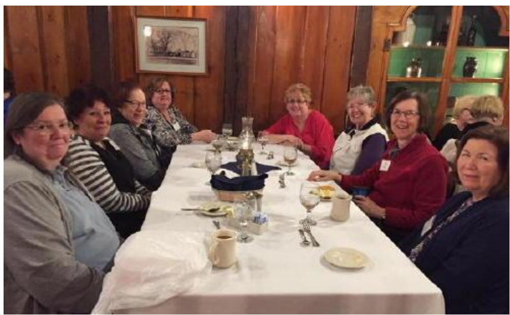
Our delicious meals were in "The Barn" at the Publick House -- right next to our stitching room!