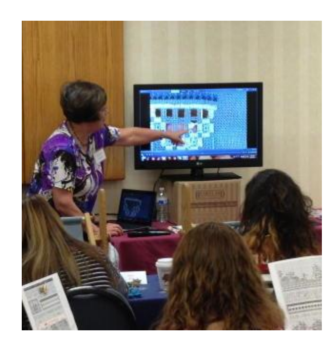
We learned so much -- from Thea and each other. WE ARE AWESOME!

In addition to learning all the specialty stitches and techniques used in this stunning sampler, we also learned how to finish it as shown in this picture -- using fabric instead of a frame! Many of us are sure to use this finishing technique on many projects in the future.