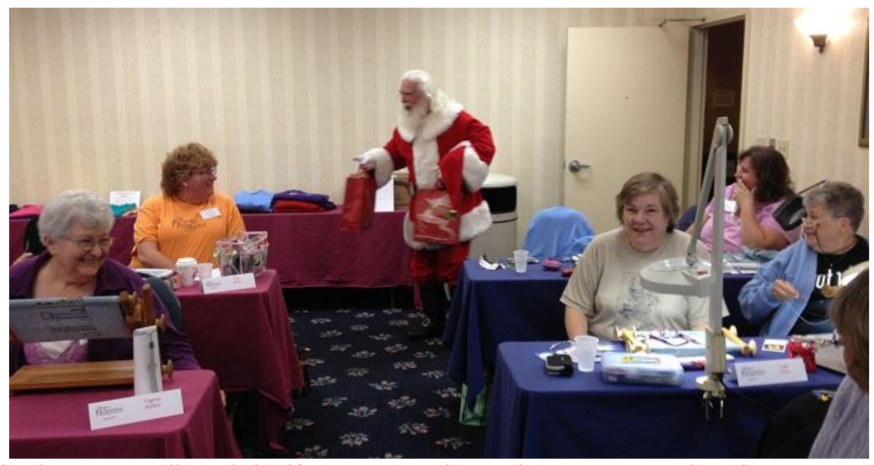
I just know you're all wondering if Santa came to the Mystic Two Retreat, and yes, he did! Much to our delight!