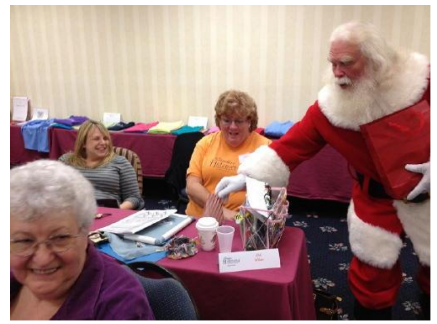
And he had gifts for all the good little stitchers, too!