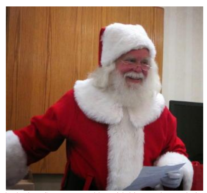
What fun we had when Santa stopped by with his naughty and nice list and gifts for all the good little stitchers!