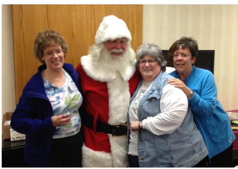
With this large and enthusiastic group, you can just imagine how wonderful our Show 'n Tell time was!