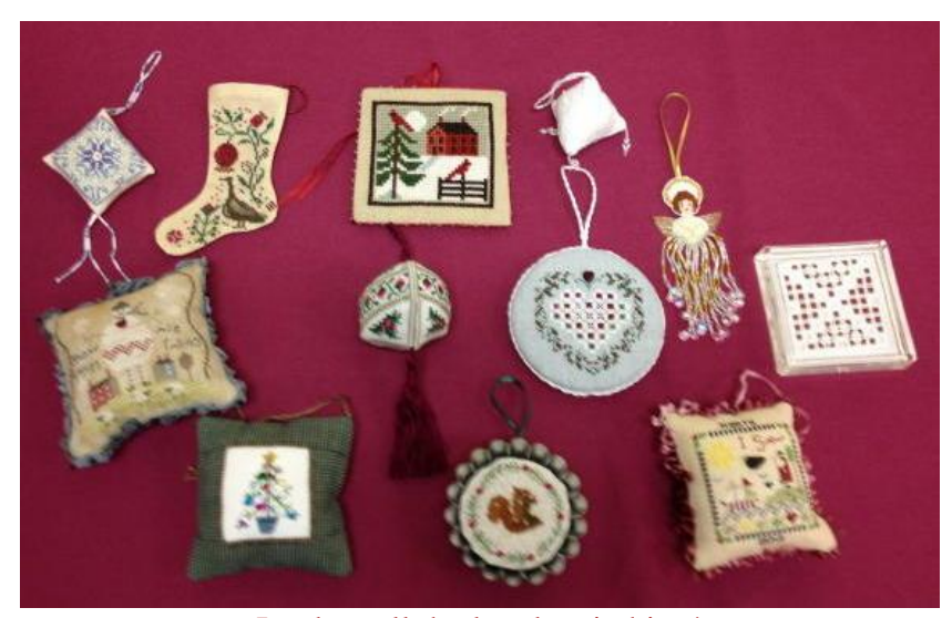
Look at all the lovely stitching!