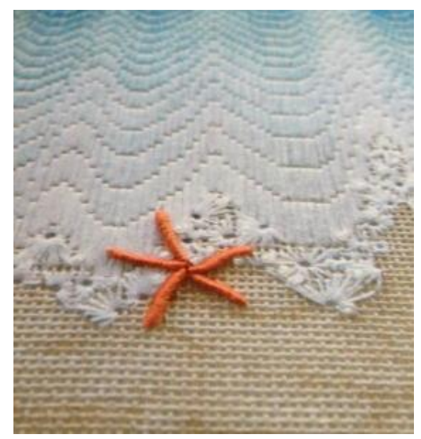
During Day 2 of our class we learned to make a Bullion Knot Stitch star fish and Eyelet foam.

Diane is such an excellent and patient teacher!