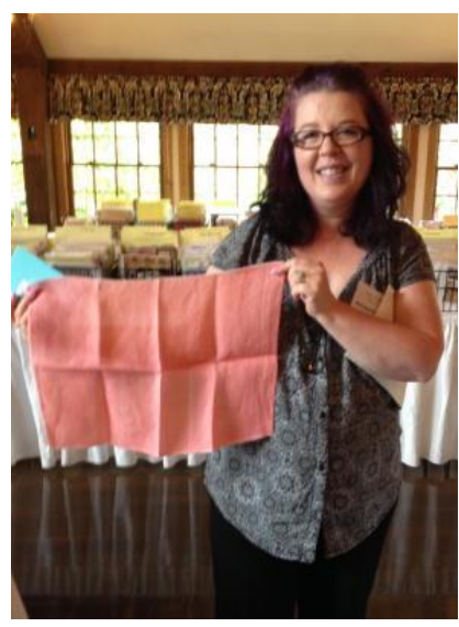
Terre with door prize from 123Stitch