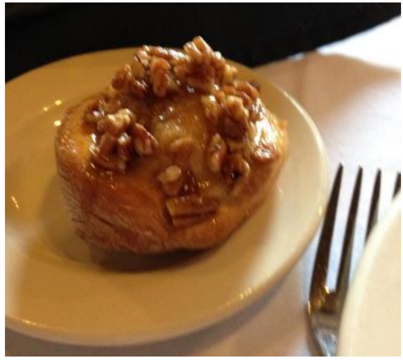
Bring on the sticky buns!!

After lunch and some more time shopping, we got right back into our class again. We had breaks during the afternoon and some shopped while others couldn't stop stitching!