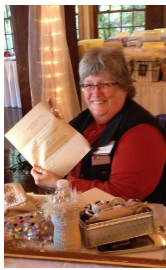
Taffy with gift certificate from 123stitch