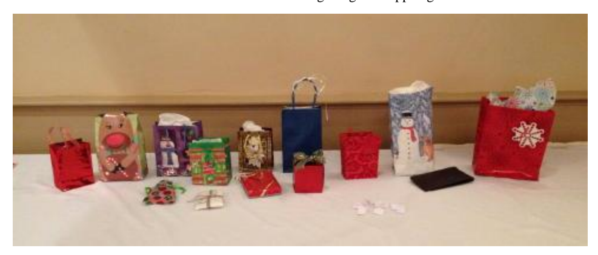
Our Christmas theme continued with an optional Christmas stitching exchange! It was hard to choose from among the gift-wrapped goodies!