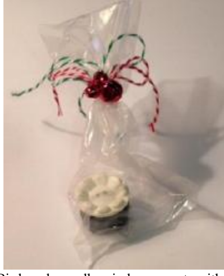
Kathi Bird made needle minder magnets with buttons for each of us -- and they were cute as a button!