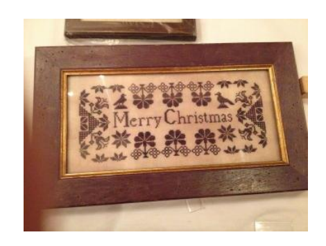
What a great time! What a great group of stitchers!! This was a fun-filled event that we'll always remember!