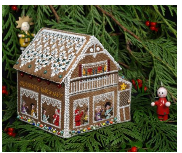
...and here's the back view showing Thea and I dressed as Santas leading a group of stitchers!