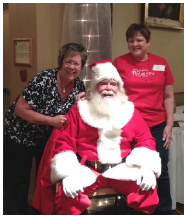
Here's a big thank you to Santa for stopping by and making merry with us!