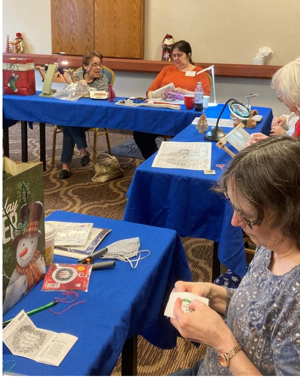
We just LOVE, LOVE the Making Memories in Mystic Retreat! It's a wonderful time of stitching with friends right before the busy holidays!