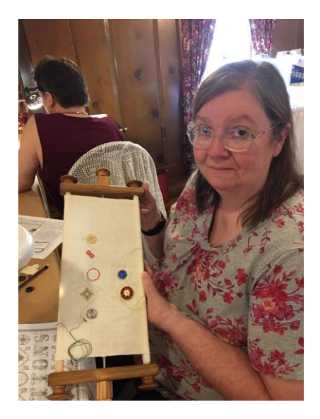
We were amazed at how quickly our stitching came together!