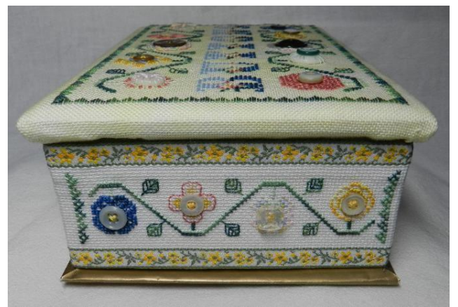
Button Box Side