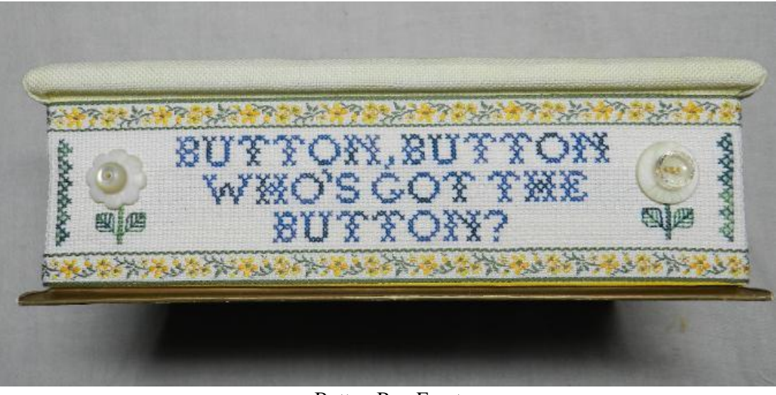
Button Box Front