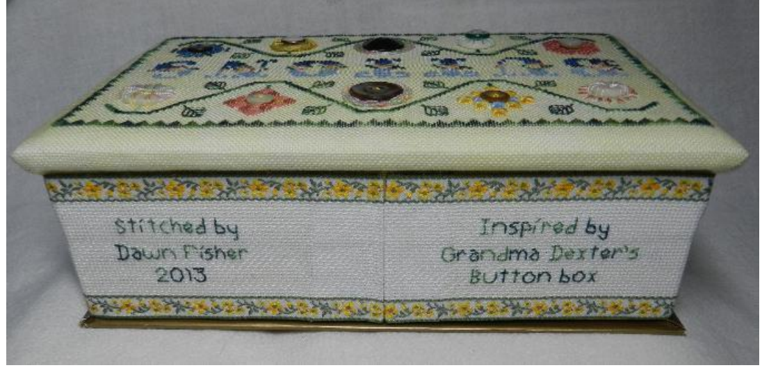
Button Box Back

The box that we used to create our Button Boxes was an empty Whitman's Chocolate Sampler box! We all managed to consume the contents prior to class so that we were all ready to make our Button Box!