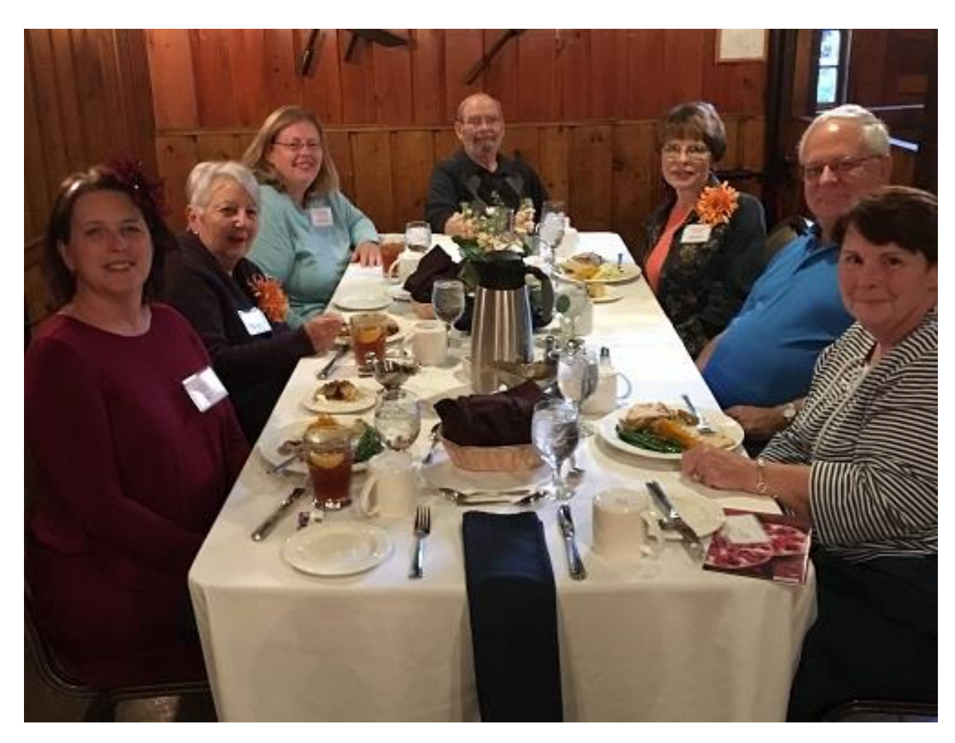
It's a good thing we had plenty of food breaks. I always announced, "It's time for our next feeding!" Heeheehee! One evening we had a complete Thanksgiving Dinner with all the trimmings!