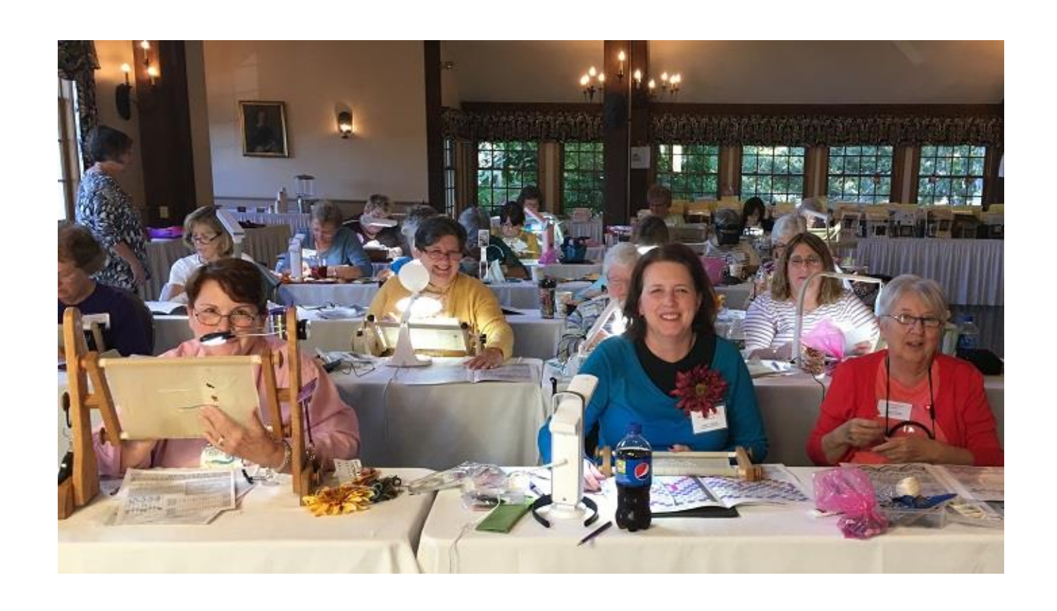
Here we are working hard...or hardly working....