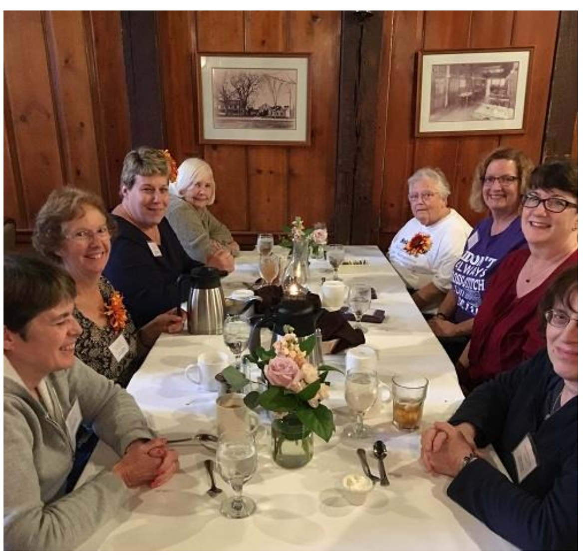
Look at us waiting so patiently to be served.