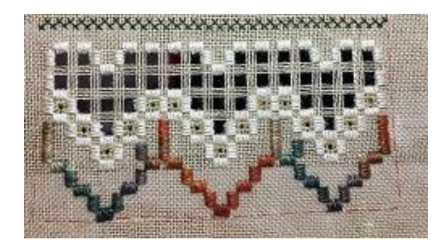
Yay! We did it!