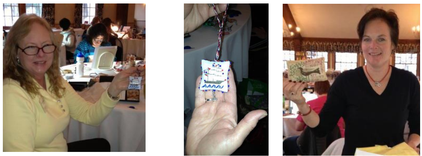
Some of the stitchers participated in a stitching exchange!