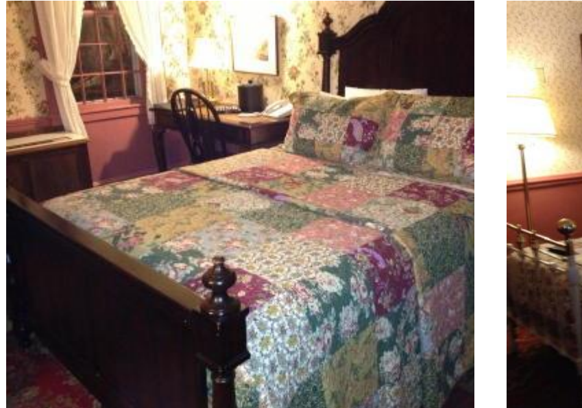
This was my room.

After setting up our stitching room for the next day, I had dinner in Ebenezer's Tavern -- oh, yum! I had their famous Chicken Pot Pie -- with a Pecan Sticky Bun, of course (drool....). By then I was ready for a good night's sleep. We had three different lodging options and this was the first time I slept in the Inn. How very cozy! I felt like I was in my grandparents' old home.