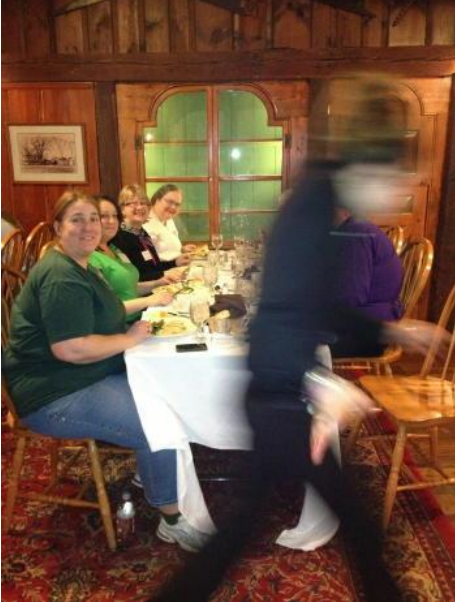
After checking the pictures I'd taken with my camera and seeing the picture to the right, well, all I could think of was the ghost of Colonel Ebenezer!!! LOL!