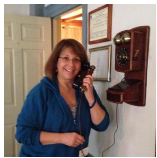
We had fun exploring the Publick House!