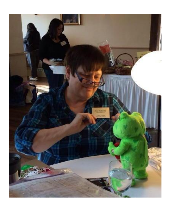
And here I am at Show 'n Tell -- and dancing "The Rippit" to a musical frog!