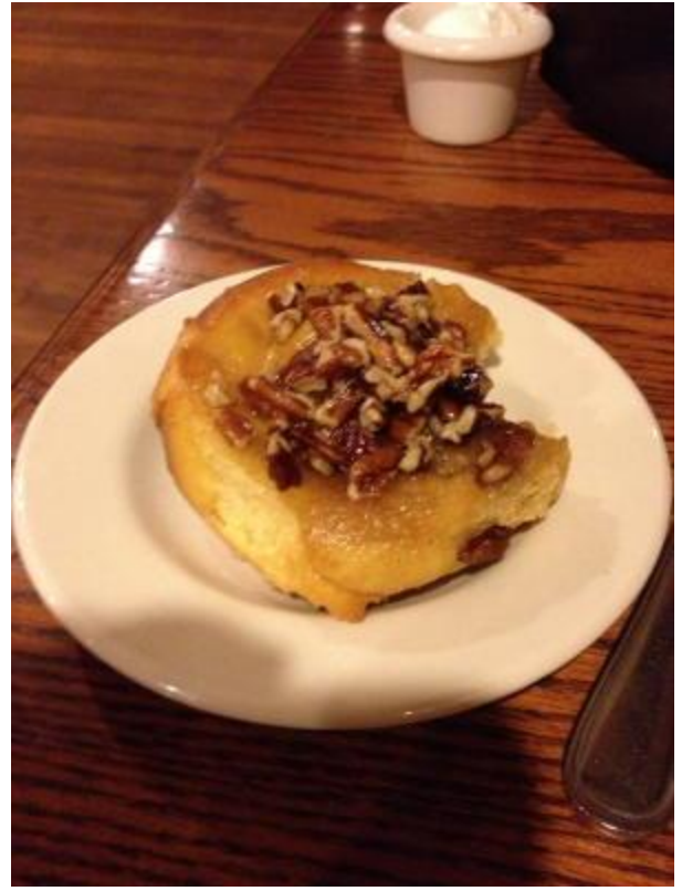
THE PECAN STICKY BUNS!!!!!!

And while all this stitching, shopping, and eating was going on, we had a wonderful view of some lightly falling snow and icicles!