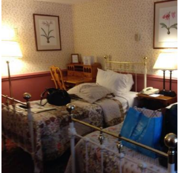
Hildie & Sharron's checked into this room the next day.

The next morning at breakfast in the Inn's main restaurant I ran into several of the attendees. We had a great time seeing each other and getting caught up. Shortly afterwards the Alumni Addicts Day and stitching frenzy began!