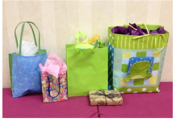
Some of us participated in an optional stitching exchange. It was hard to choose which gift-wrapped present to select!