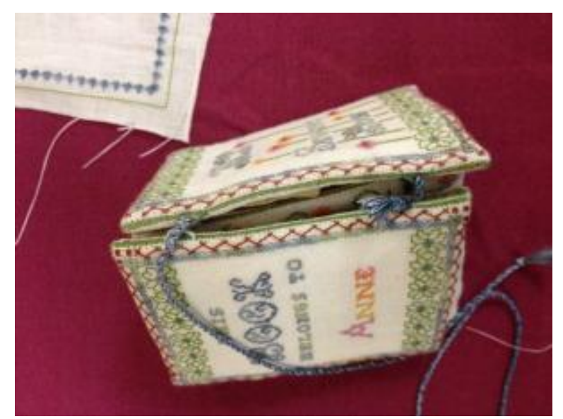
That night we had some Show 'n Tell! WE ARE AWESOME!