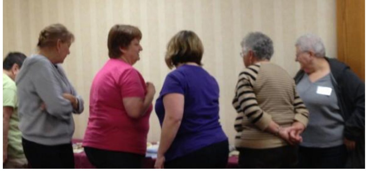
We heard some great stories to go along with some of the Show and Tell, and afterwards we had a close up of everyone's works of art.