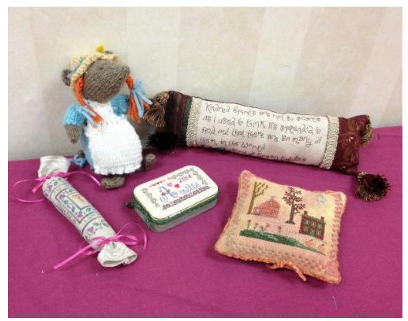
Stitched gifts revealed!