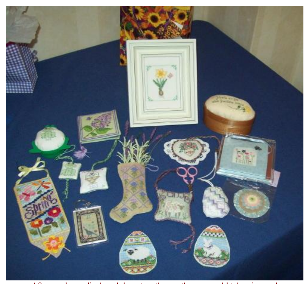
Afterwards we displayed them together so that we could take pictures!

We had yummy meals catered by Mystic Market, and with each of us being on our own stitching schedule, many of us lingered long over meals and just enjoyed each other's company.