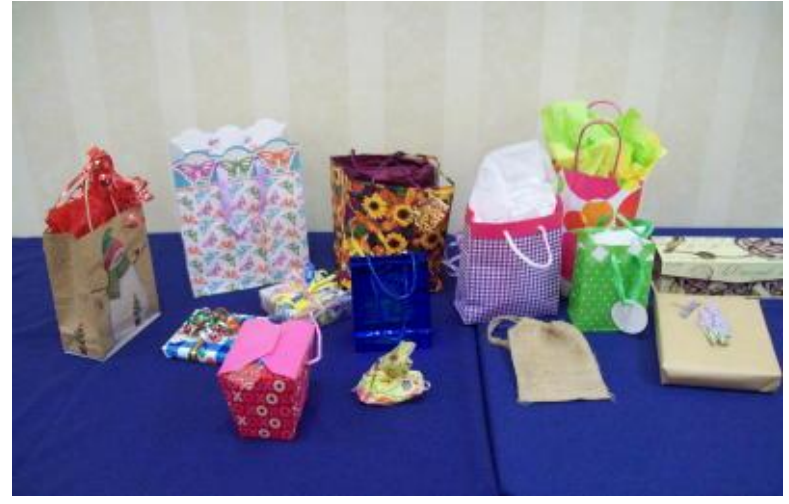
It was very difficult to choose from among such pretty packages!

At this retreat we had an optional stitching exchange. All participants stitched up something to do with Spring and finished the stitching in some way -- framed, ornament, etc. The variety of objects was awesome!