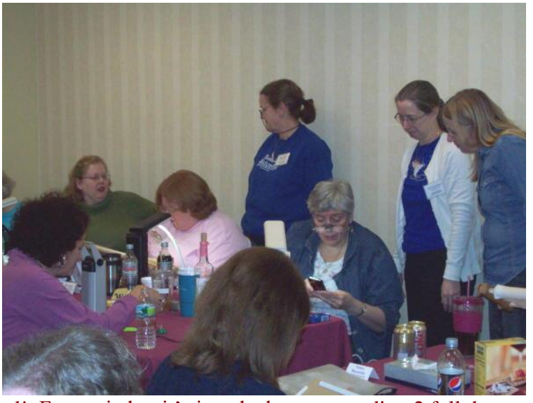
What a fun time we had! For a stitcher it's just the best -- spending 2 full days and nights with other addicts, admiring each other's work, and furthering our own addiction! LOL!! And now I'm looking forward to the 2014 Alumni Events!!