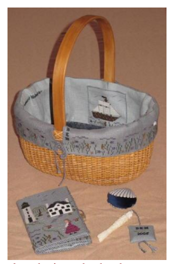
Barb also designed a basket to go with Ellen Chester's Call of the Sea project.