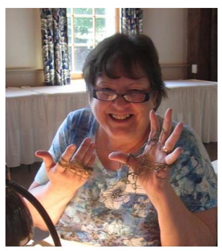
I have no explanation for this exploding skein -- except, really, doesn't this seem like the kind of thing that happens to me?