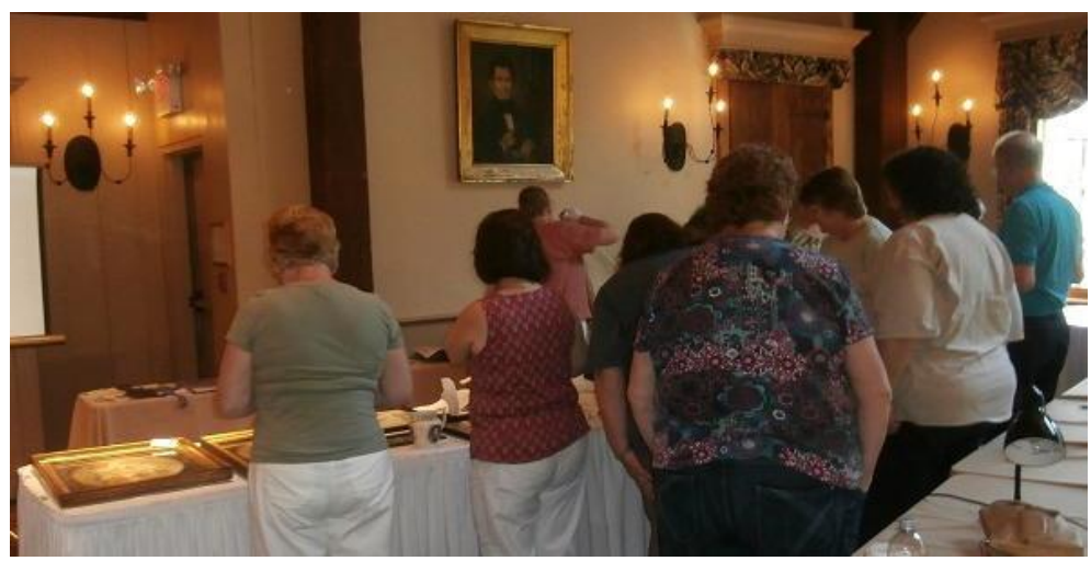
Later that night I presented a gift to all the attendees -- a new design I call "Liberty." My stitched model was finished into a banner.