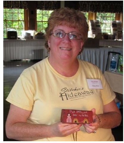
Deb completed another With My Needle design -- changing all the linen and thread colors!