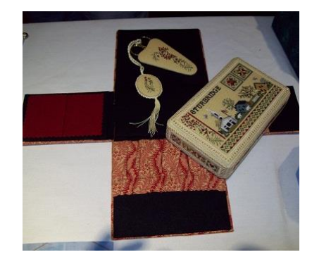
A finished Sturbridge Sewing Box!