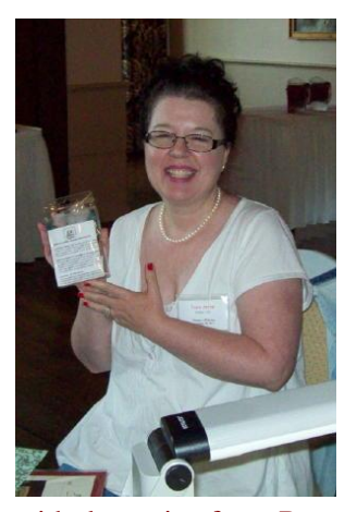
Terre with doorprize from \frac{Rosewood}{Manor}