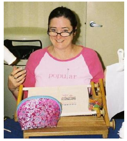
So "Popular" Dawn