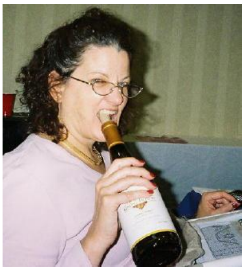
Friends don't let friends stitch drunk