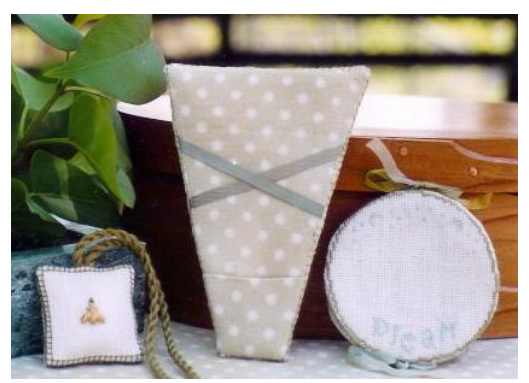
Dreamkeeper Accesories - Back