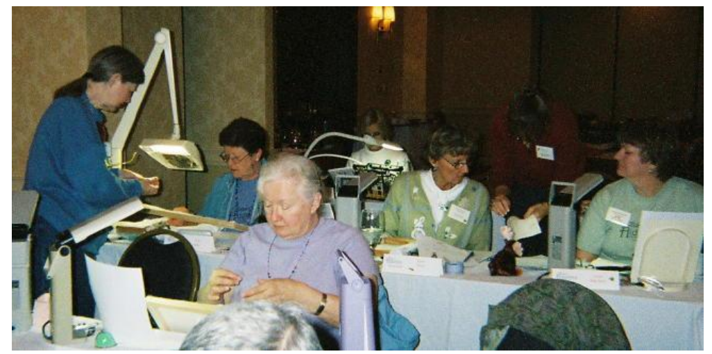
And so we had a cozy, lazy afternoon of stitching and chatting together.