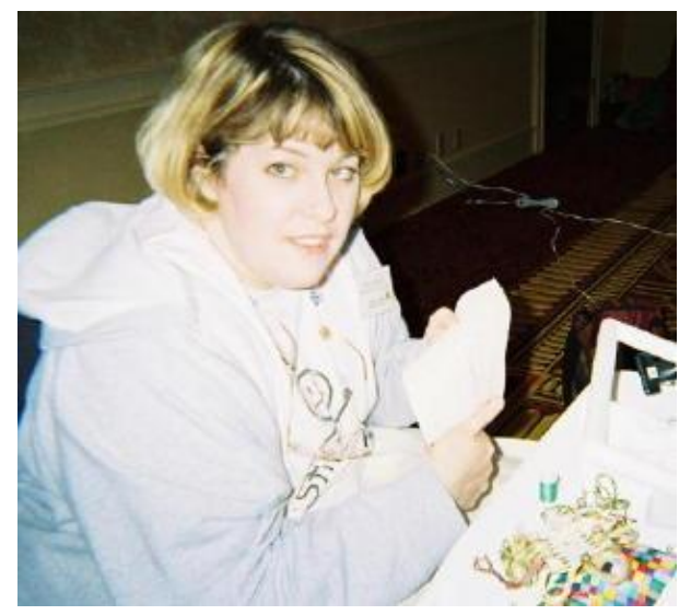
The Birthday Girl!