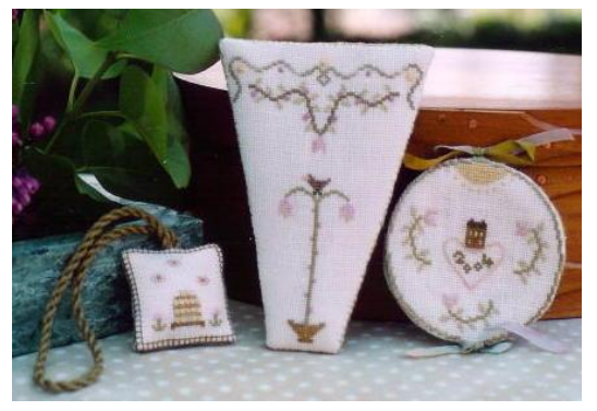
Dreamkeeper Accesories - Front