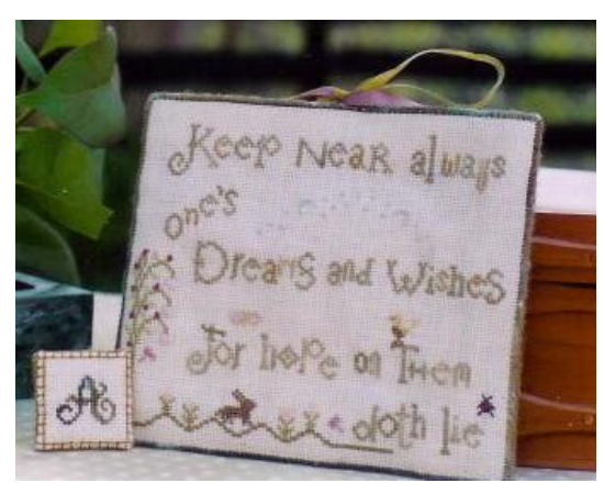
Back of the Dreamkeeper