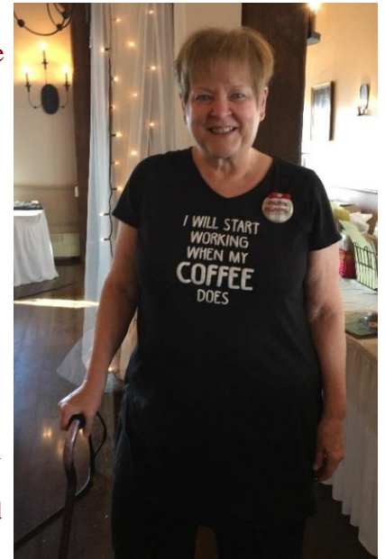
Have cane will travel!

I had a great time being with everyone but was forbidden to cross stitch due to whiplash injuries. I sure missed being able to stitch, but what fun I had going from table to table to spend time catching up with everyone! I had the use of an office chair with wheels that allowed me to glide around the room (what a sight!) and a cane to help me the rest of the time.