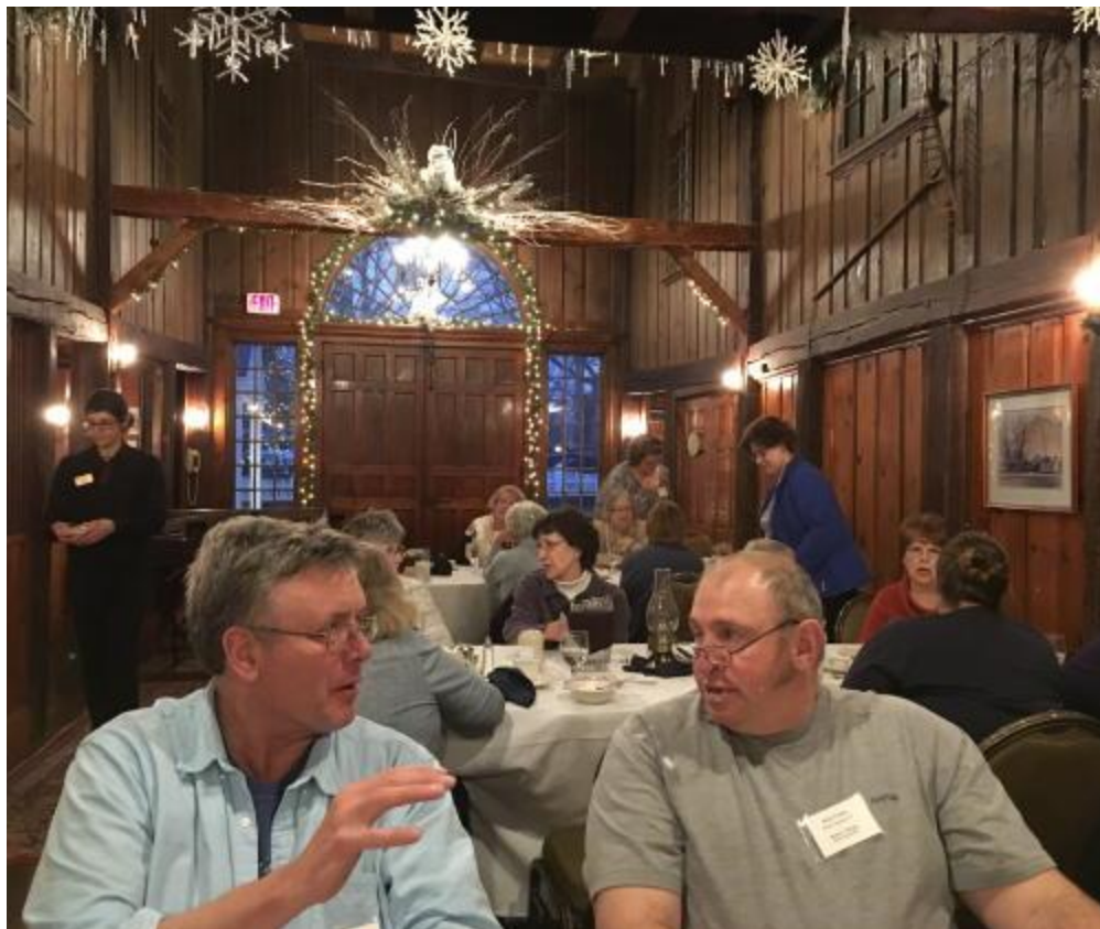
The ceiling was decorated with big snowflakes and icicles.