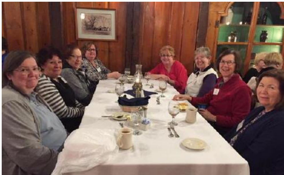
Our delicious meals were in “The Barn” at the Publick House -- right next to our stitching room!