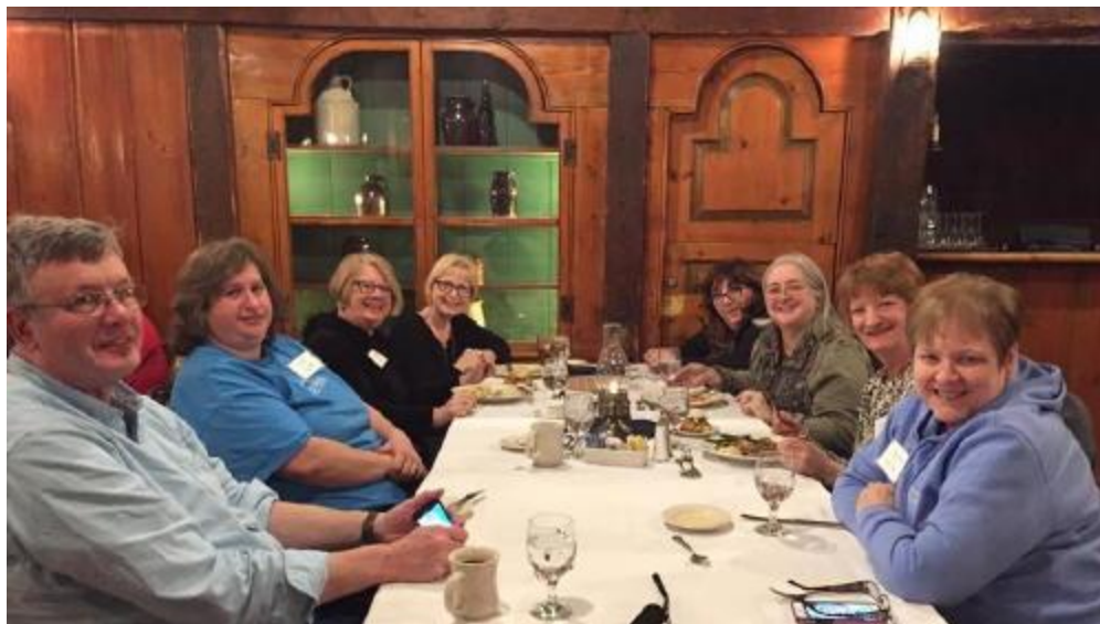
Before and after each meal we enjoyed hanging out and chatting.