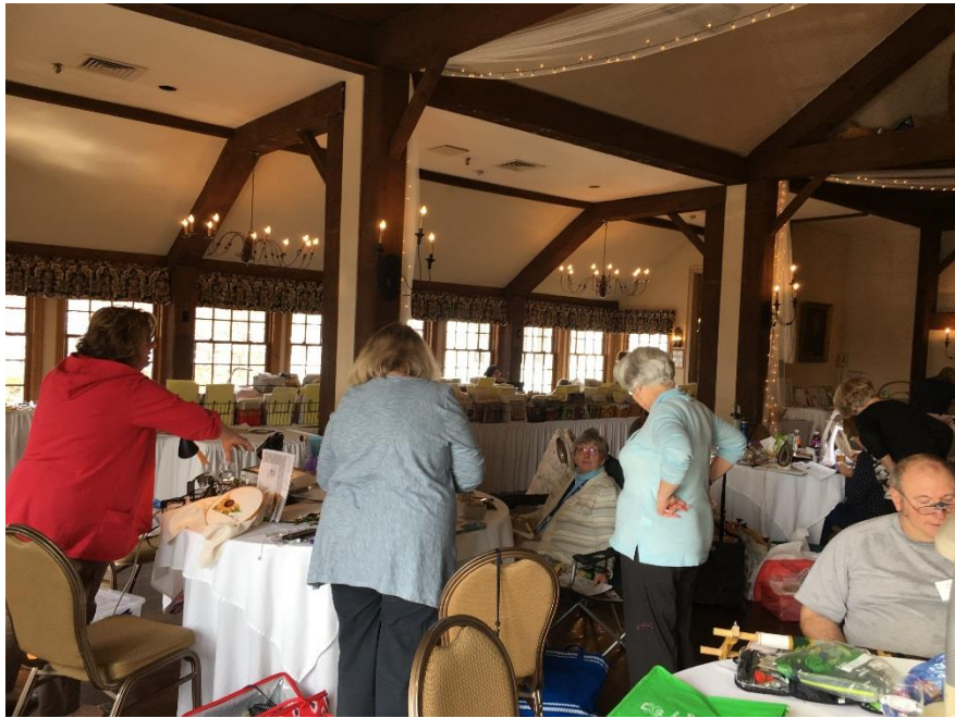
What fun to hear the buzz of all the conversations and laughter!