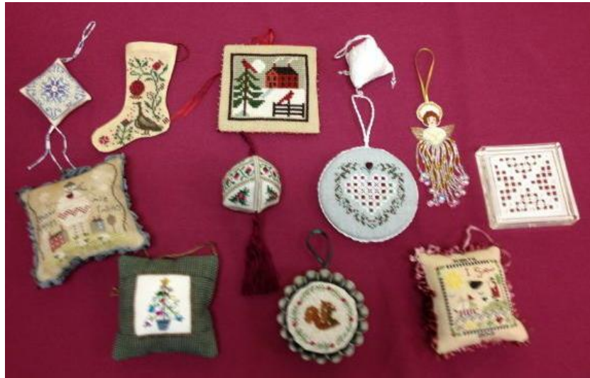
Look at all the lovely stitching!