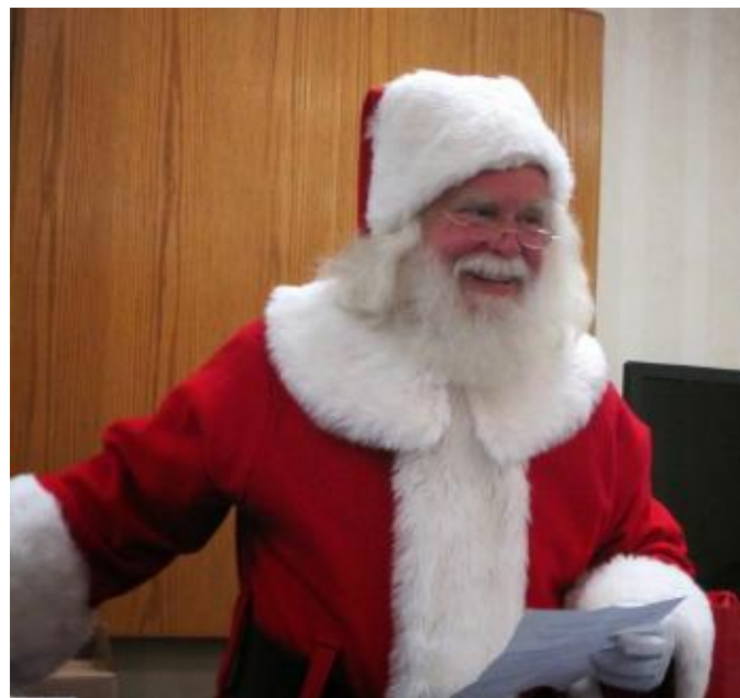
What fun we had when Santa stopped by with his naughty and nice list and gifts for all the good little stitchers!