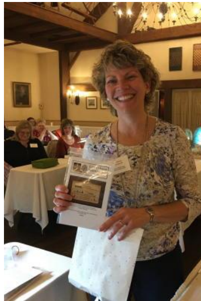
Door prize from an Anonymous Donor