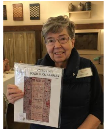
Door prize from Rosewood Manor