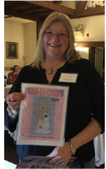
Door prize from an Anonymous Donor