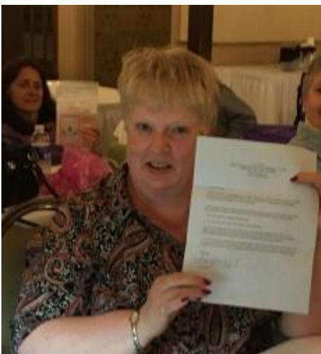
$25 Gift Certificate from 123stitch!