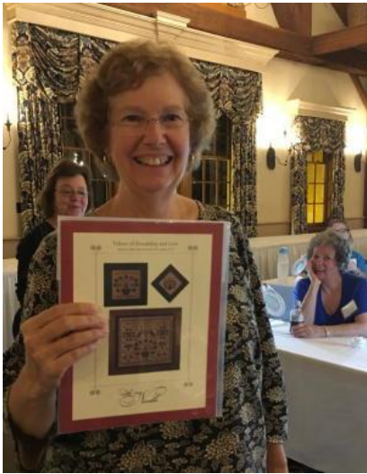
Door prize from With My Needle