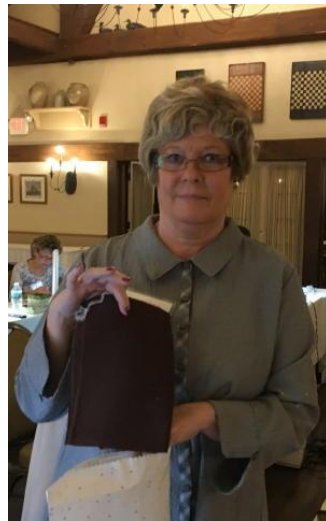
Door prize from 123stitch