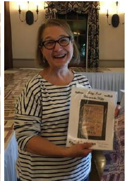
Door prize from Morning Glory Needleworks

The door prizes just kept coming and coming! Donors, you added so much to our fun!!