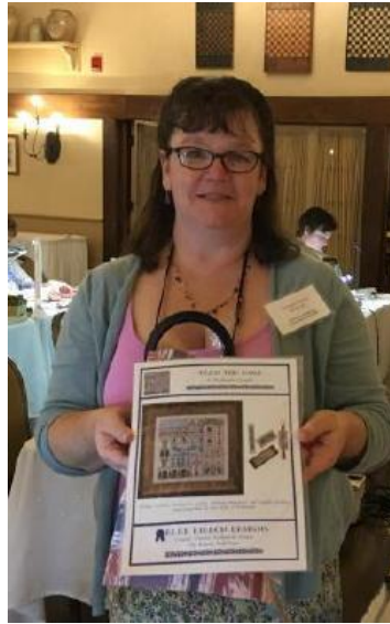
Door prize from an Anonymous Donor