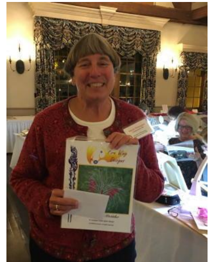
Door prize from 123stitch