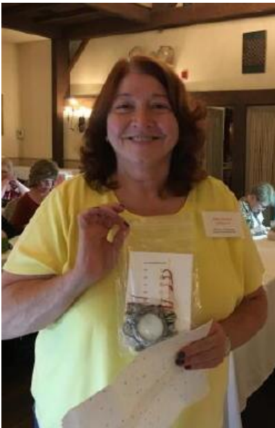
Door prize from an Anonymous Donor