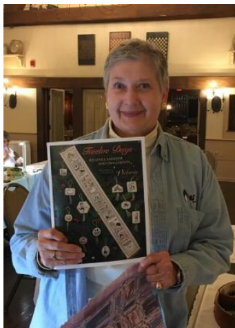
Door prize from an Anonymous Donor