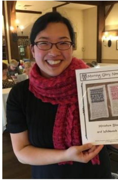
Door prize from Morning Glory Needleworks