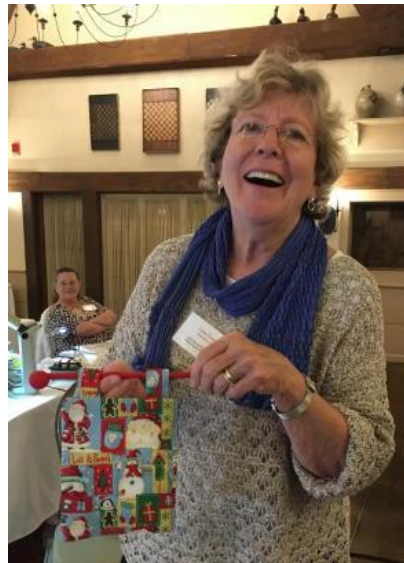
Door prize from Stitchers Hideaway