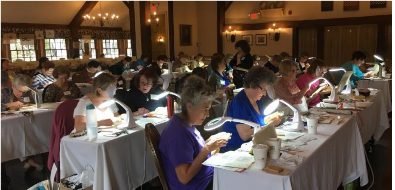
Look at how deep in concentration we were!