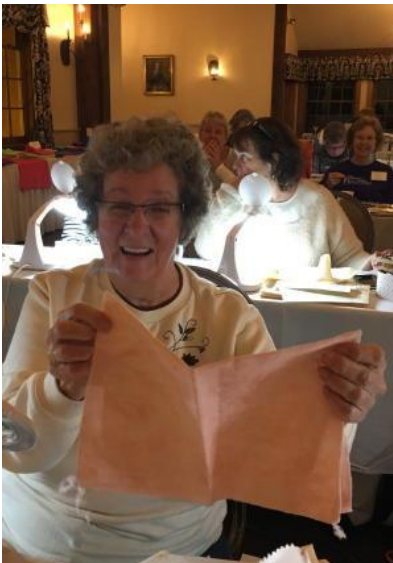
Door prize from 123stitch!