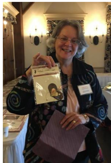
Door Prize from Bush Mountain Stitchery