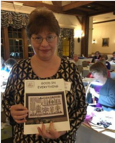
Door prize from Rosewood Manor