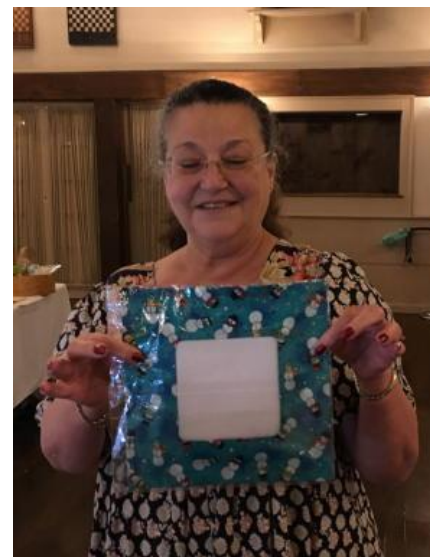
Door prizes from an anonymous donor