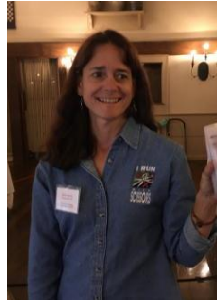
Door prize from an Anonymous Donor