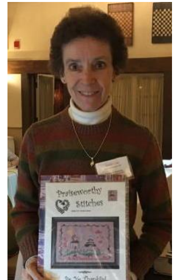
Door prize from Praiseworthy Stitches