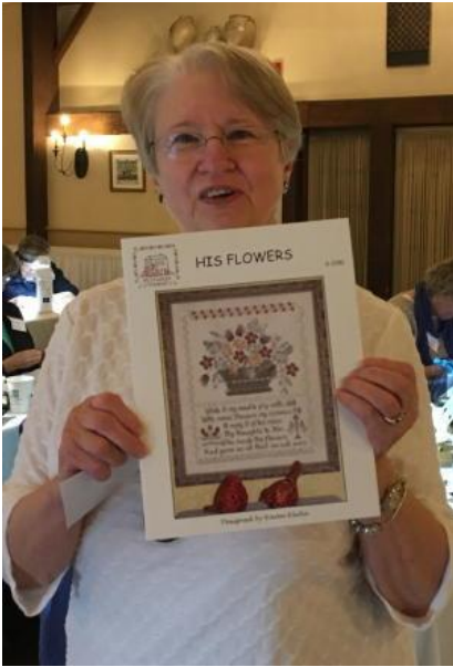
Door prize from Rosewood Manor