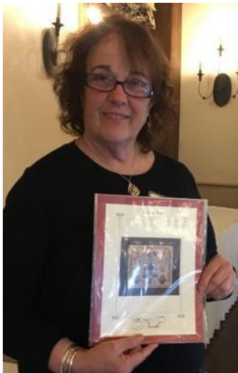
Door prize from With My Needle

And the door prizes just kept coming and coming!!