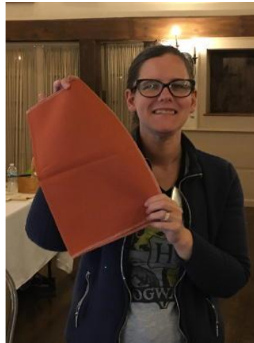
Door prize from 123Stitch