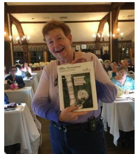
Door prize from Victoria Sampler