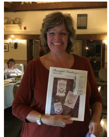
Door Prize from an Anonymous Donor