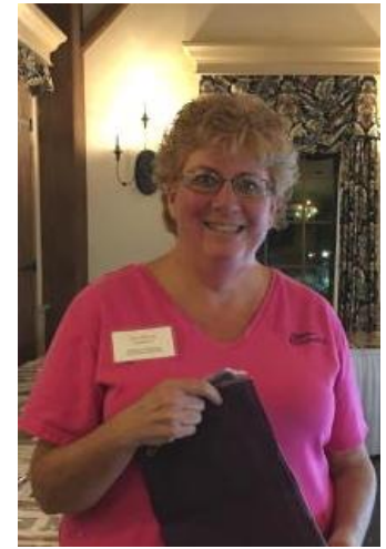
Door prize from 123Stitch