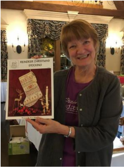
Door prize from Rosewood Manor