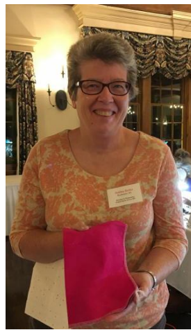
Door prize from 123stitch