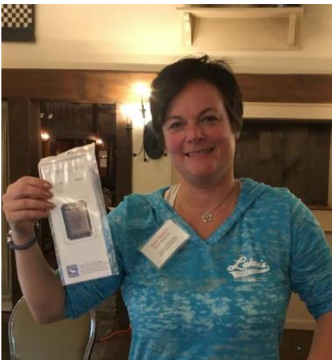
Door Prize from an Anonymous Donor