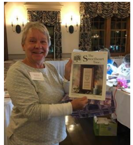
Door prize from an Anonymous Donor