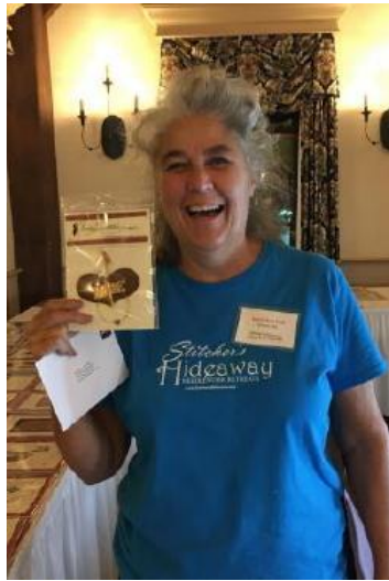
Door prize from Bush Mountain Stitchery