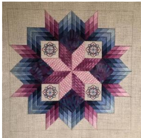
Stitched by Sue Donnelly