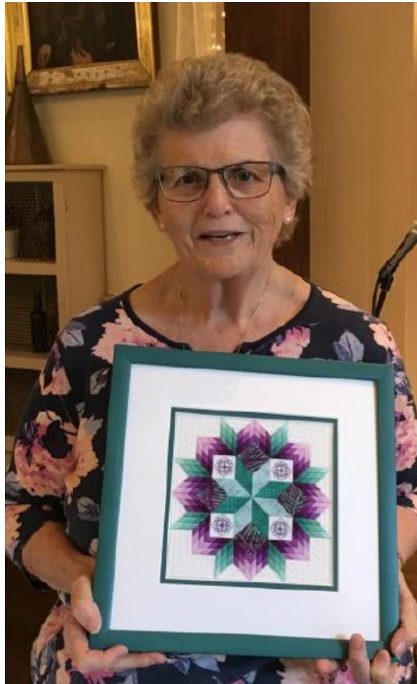
Our wonderful instructor holding a stitched model of her beautiful Cubed Star design.

It has been barely two weeks since this retreat was held and the rapid progress we have made on our Cubed Stars is remarkable! Here are a few pictures, which allow you to see some of the different colorways we chose.