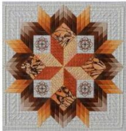
Sweet Potato/Brown, layout A

For her Cubed Star design, she incorporated the use of batik fabric and a several different stitches. We had our choice of colorway from the great variety that she offered. There were so many it was hard to choose from among them! And depending on where we chose to place the sections and which colors we wanted to use where, the end results were quite different.