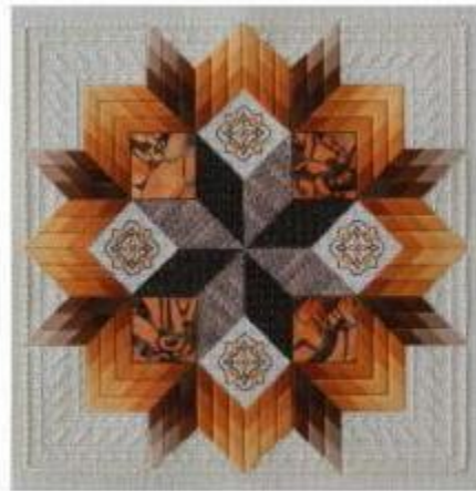
Sweet Potato/Brown, layout B

Jeanette got us started by having us mount our batik fabric wherever we chose to place it, and soon we were stitching away happily and watching our design come to life. You just wouldn't believe how much we actually got done in class!