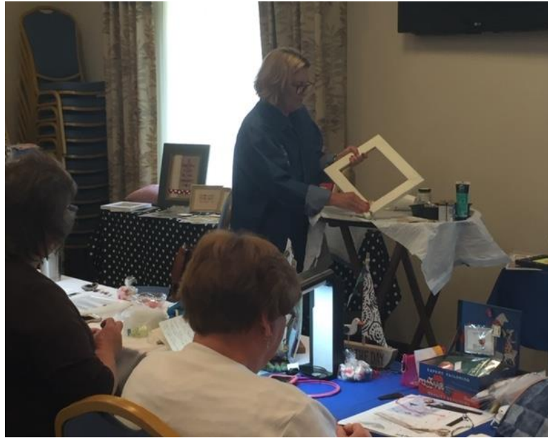
Now applying the chalk paint over the base coat