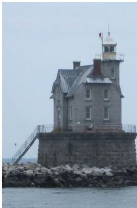
Race Rock Lighthouse