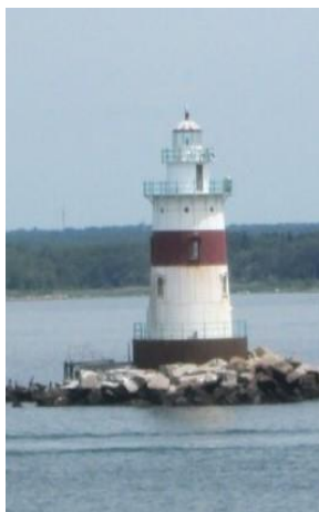
Latimer Reef Lighthouse