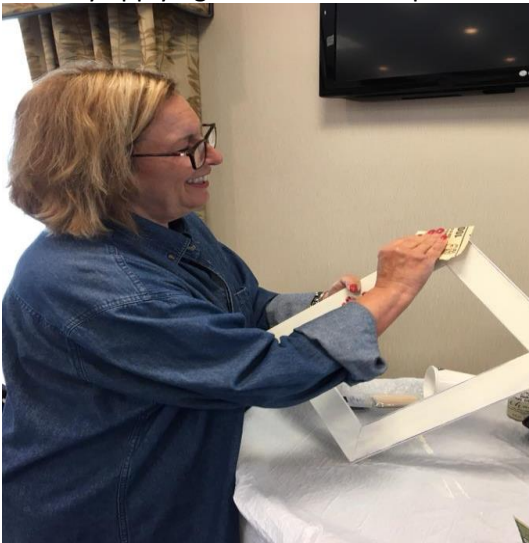
A little sanding to reveal the color beneath