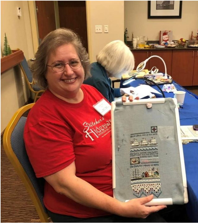
Working on the Mystic Christmas Sampler