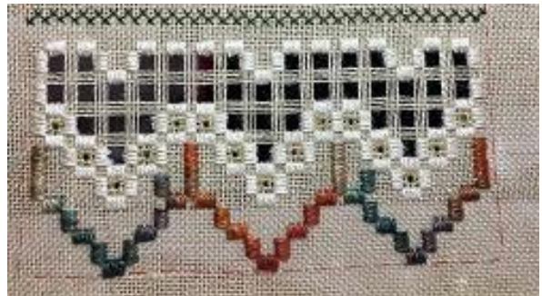
Yay! We did it!