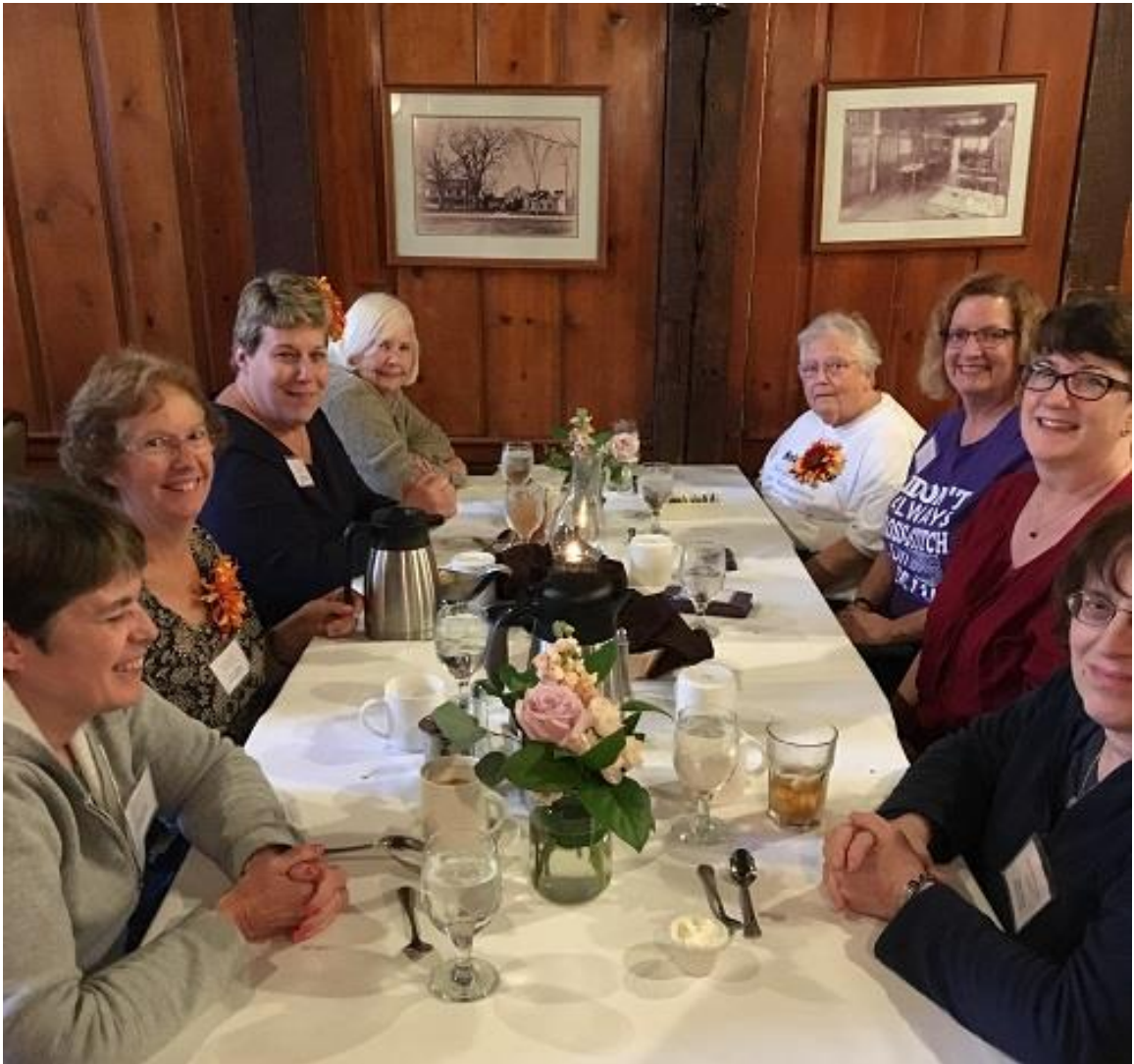
Look at us waiting so patiently to be served.