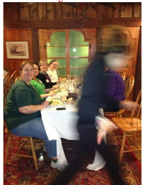
After checking the pictures I'd taken with my camera and seeing the picture to the right, well, all I could think of was the ghost of Colonel Ebenezer!!! LOL!