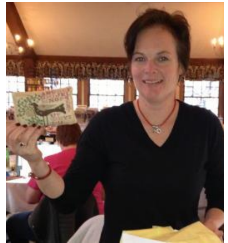
Some of the stitchers participated in a stitching exchange!