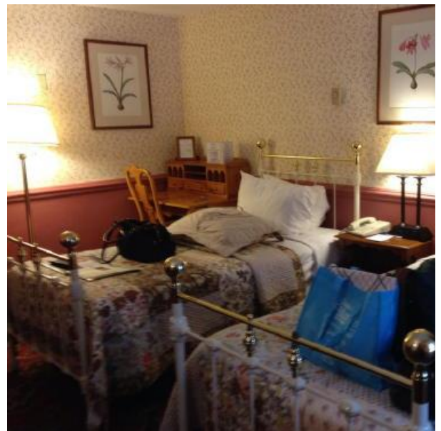
Hildie & Sharron's checked into this room the next day.

The next morning at breakfast in the Inn's main restaurant I ran into several of the attendees. We had a great time seeing each other and getting caught up. Shortly afterwards the Alumni Addicts Day and stitching frenzy began!