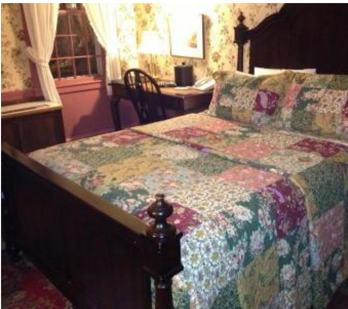
This was my room.

After setting up our stitching room for the next day, I had dinner in Ebenezer's Tavern -- oh, yum! I had their famous Chicken Pot Pie -- with a Pecan Sticky Bun, of course (drool....). By then I was ready for a good night's sleep. We had three different lodging options and this was the first time I slept in the Inn. How very cozy! I felt like I was in my grandparents' old home.