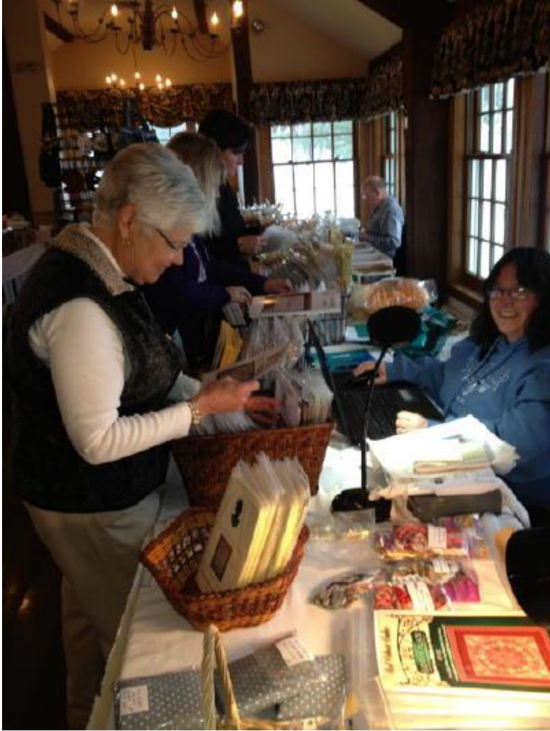
Oh, what stash we had!!! The door prizes were wonderful!!

There was a lot of talking and laughing going on -- and shopping!!!! Bush Mountain Stitchery & Framing had set up shop for us -- Wheeee!!!!