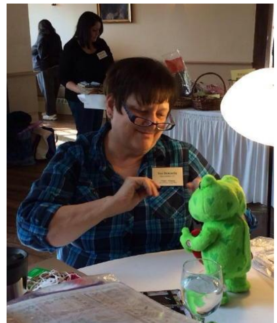
And here I am at Show 'n Tell -- and dancing "The Rippit" to a musical frog!