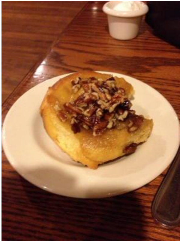
THE PECAN STICKY BUNS!!!!!!

And while all this stitching, shopping, and eating was going on, we had a wonderful view of some lightly falling snow and icicles!