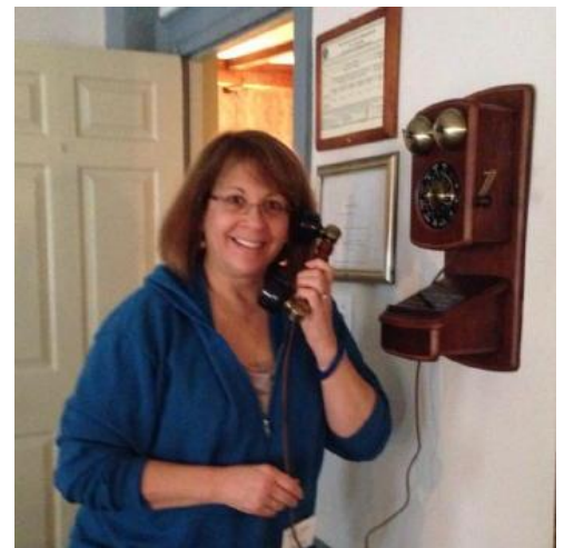
We had fun exploring the Public House!