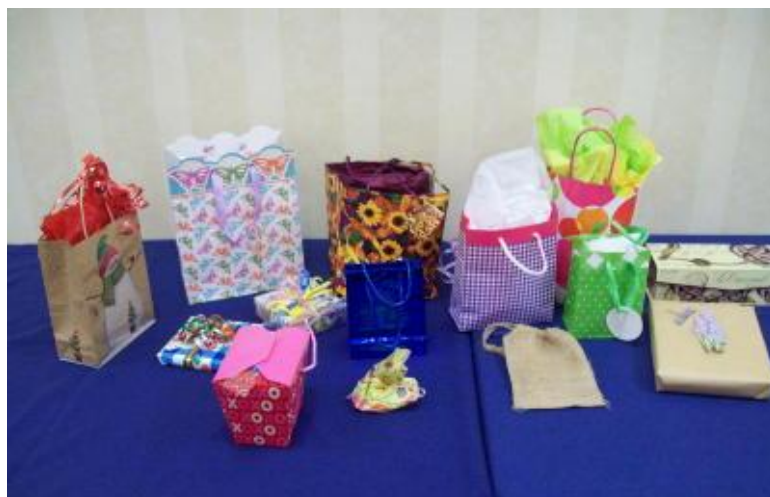
It was very difficult to choose from among such pretty packages!

At this retreat we had an optional stitching exchange. All participants stitched up something to do with Spring and finished the stitching in some way -- framed, ornament, etc. The variety of objects was awesome!