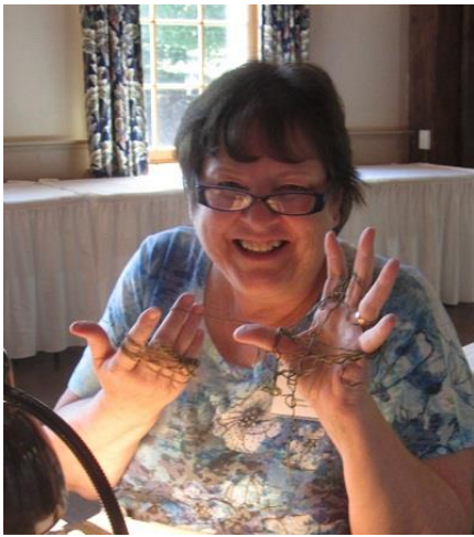
I have no explanation for this exploding skein -- except, really, doesn't this seem like the kind of thing that happens to me?