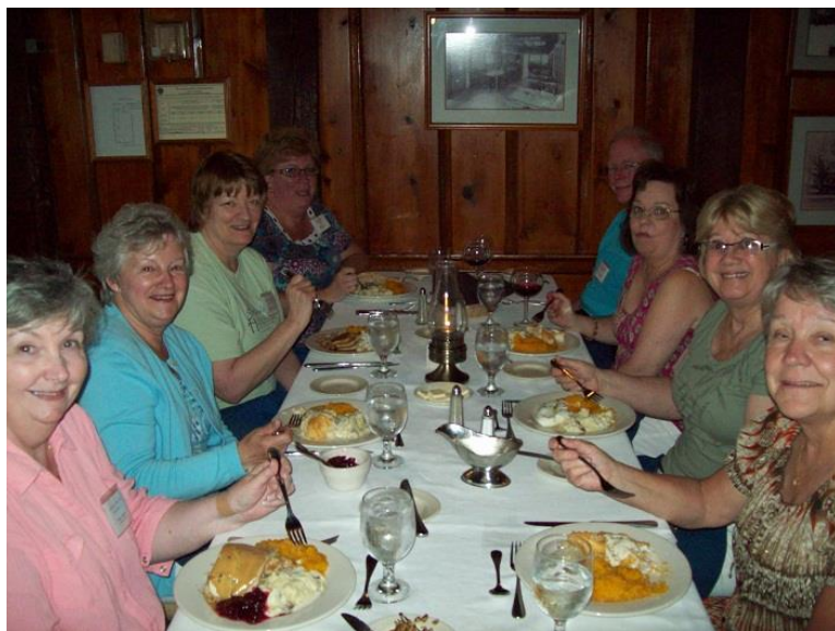
We had some YUMMY meals at the Publick House!