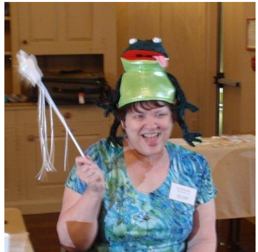
And let it be known that at this retreat my coronation as Frog Princess was held!

On our last night together, we had a great time of Show 'n Tell! We are just AWESOME STITCHERS!!!