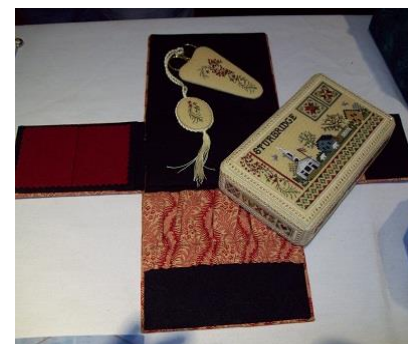
A finished Sturbridge Sewing Box!