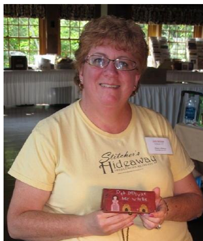
Deb completed another With My Needle design -- changing all the linen and thread colors!