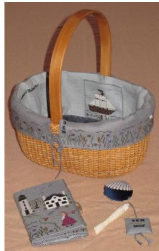
Barb also designed a basket to go with Ellen Chester's Call of the Sea project.