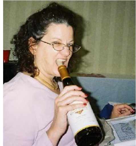
Friends don't let friends stitch drunk