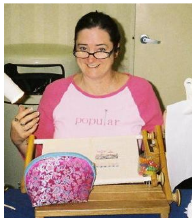
So "Popular" Dawn