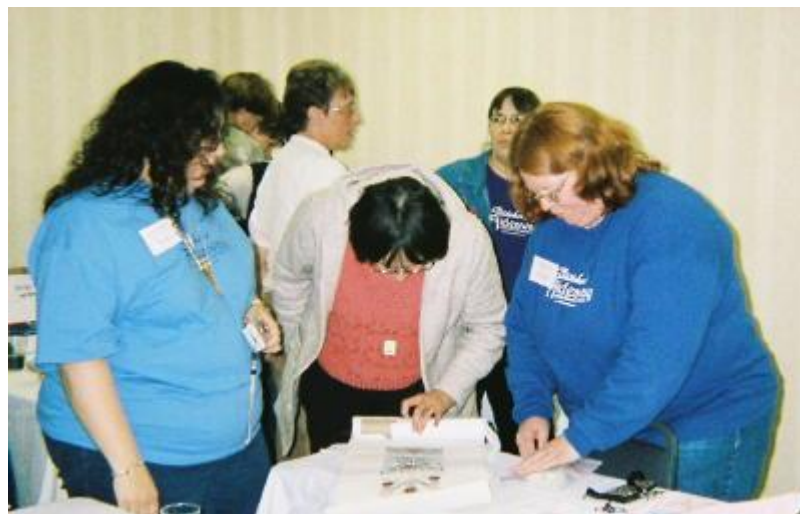
Admiring each other's work