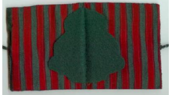
The inside had a felt tree to hold needles.

The generous folks at Weeks Dye Works donated WDW Holly for this project. It was a perfect match! Thank you so much!