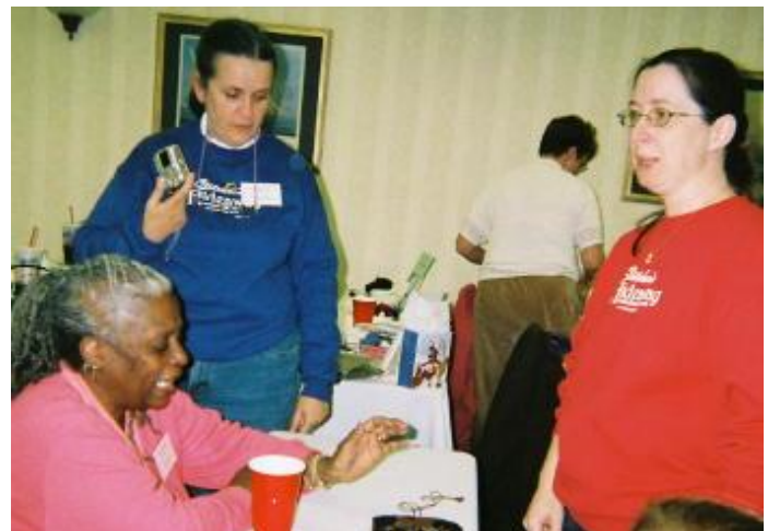
Chatting during a break