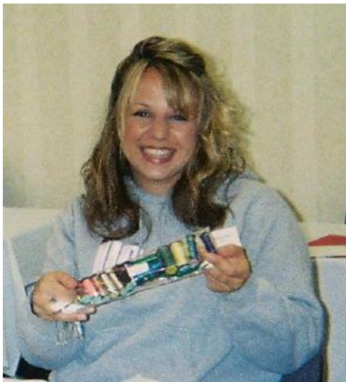
Door Prize from Kreinik