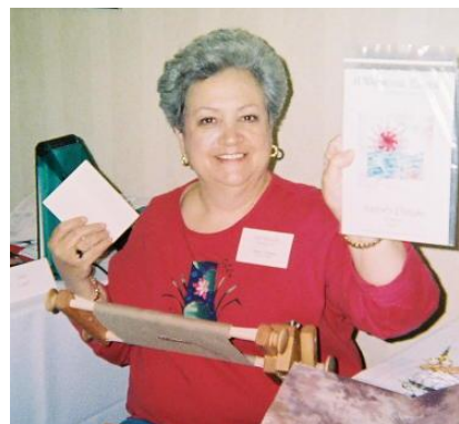
Door Prize from A Whimsical Element