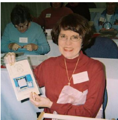
Doorprize from Stitchy Kitty