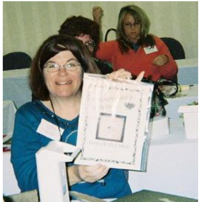
Door Prize from Praiseworthy Stitches