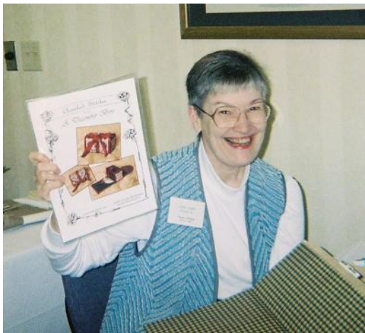
Door Prize from Cherished Stitches

As with the Mystic One retreat, our time together was peppered with door prizes, door prizes, door prizes! Woo-hoo!! Everyone enjoyed seeing what the other received.