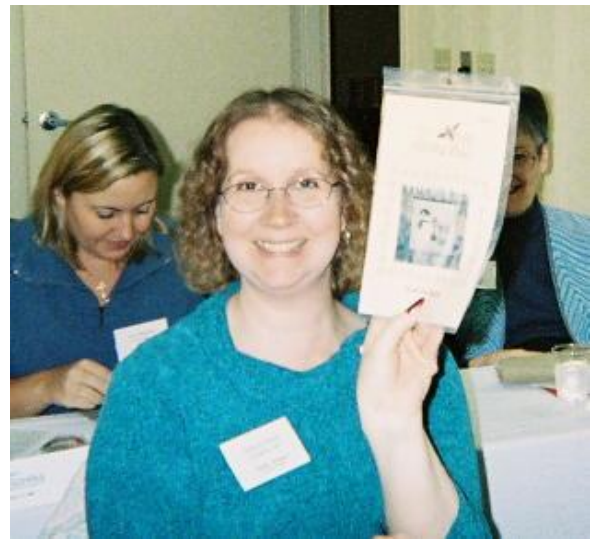
Door Prize from Glory Bee