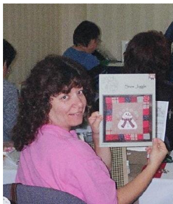
Door Prize from Knotted Tree

After some more drooling over the trunk show, we headed back for class and periodic door prize drawings. Donors really outdid themselves. There were squeals of delight as the prizes were revealed. A Whimsical Element, Brittercup Designs, Calico Crossroads, Cherished Stitches , Chris's Collection, Earth Threads, Finger Work, Glory Bee , Interweave Press, Jeannette Douglas Designs , Knotted Tree NeedleArt, Kreinik , Lavender Wings, M Designs, monsterbubbles, Nordic Needle, Praiseworthy Stitches , Rosewood Manor , Stitchy Kitty, The Victoria Sampler , With My Needle , and Stitches' Hideaway. The donors were so very generous!