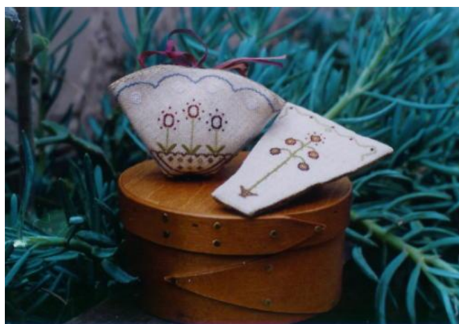
Our Project -- Outside View

We settled down to begin working on our retreat project, the Cottage Garden Needlework Set-Autumn Mums , under the instruction of Ann & Liz. The fabric was wonderful, the threads beautiful and soft, directions clear, and we dove right into our stitching.