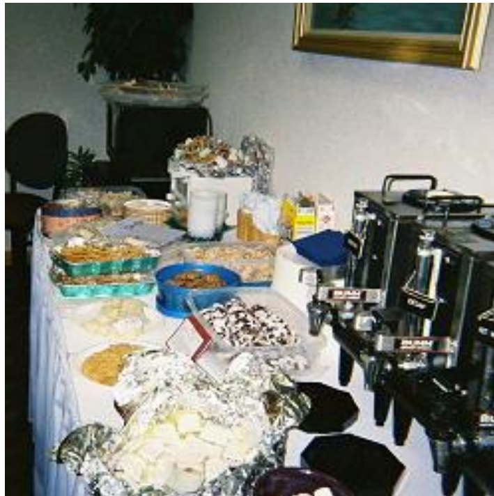
And they were all calorie-free!!

Many of us made a batch of our favorite Christmas cookies to share and the assortment filled up a loooooong table. We nibbled on them all weekend! Everything was so yummy!