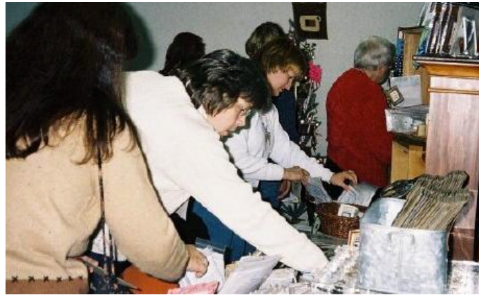
The Stash Enhancement Frenzy