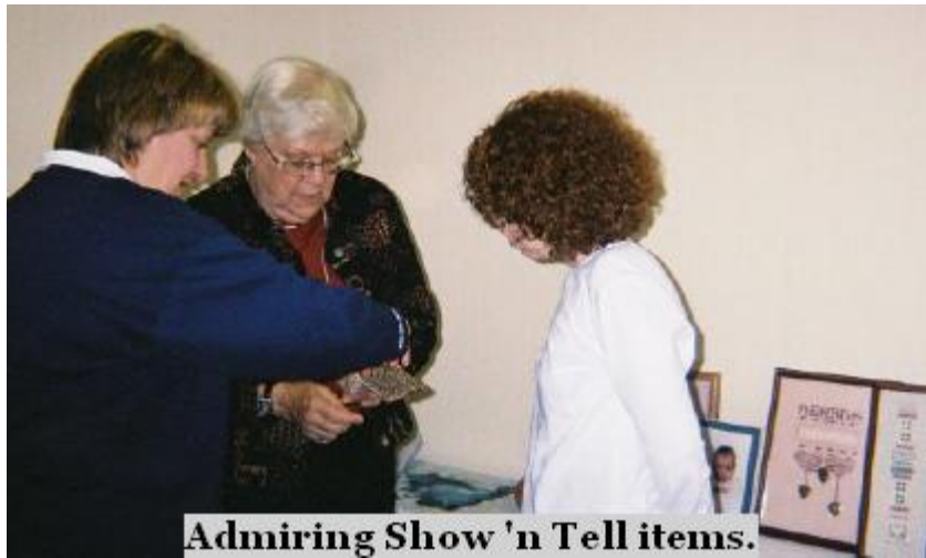
Admiring Show 'n Tell items.