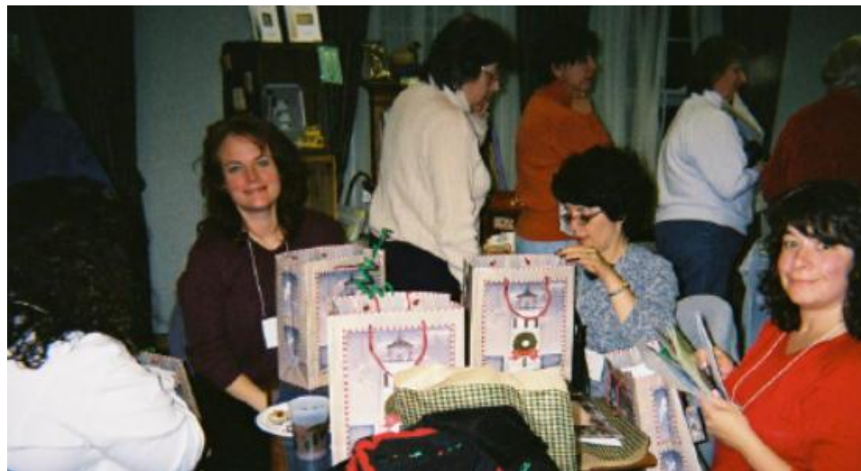
Playing with the Fun Pack stash

Stitchers gathered from NY, NH, MA, NJ, ME, CT, and RI. Those who traveled by ferry from NY had wild tales to tell of their ocean voyage. An INCREDIBLE windstorm had hit the east coast and even just driving on the highways was difficult. But they all made it in one piece, and arrived ready for fun!