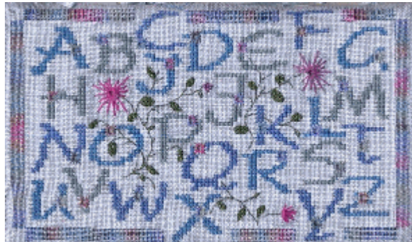
Wild Thing - Back