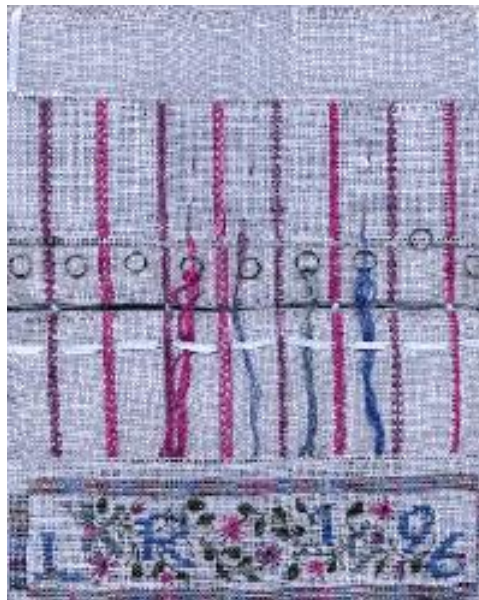
Wild Thing Inside